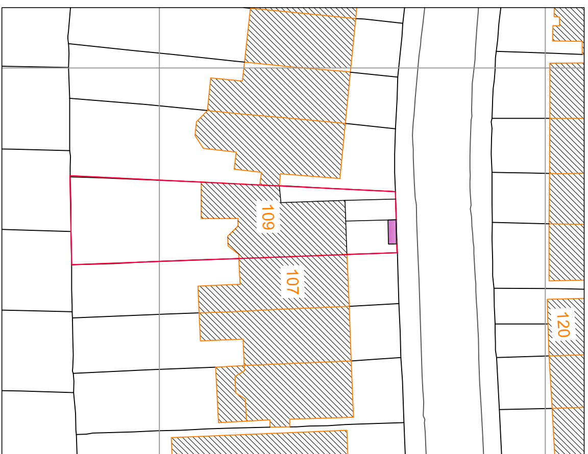
Existing Block Plan, scale 1: 500