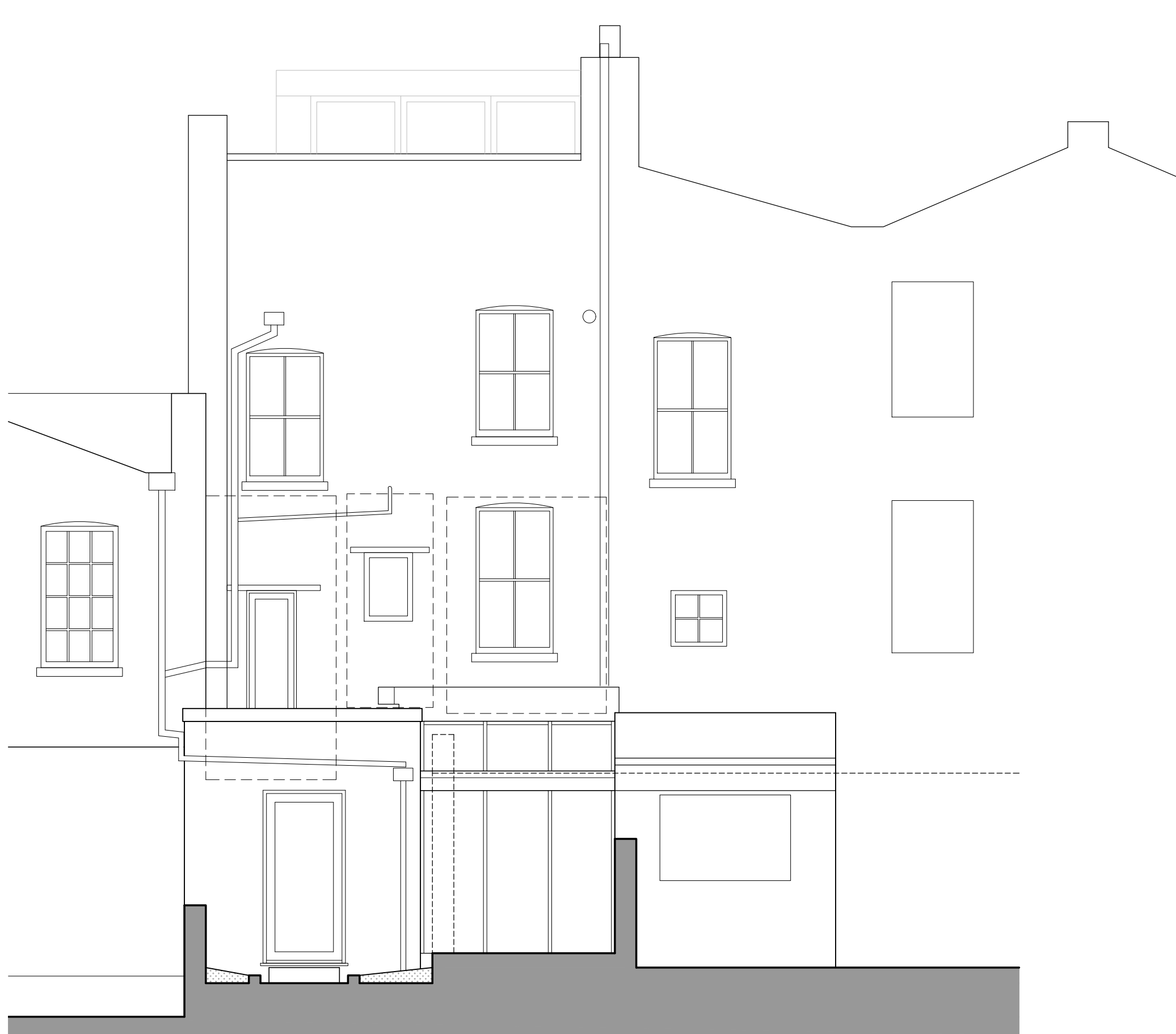
EXISTING SECTION EE