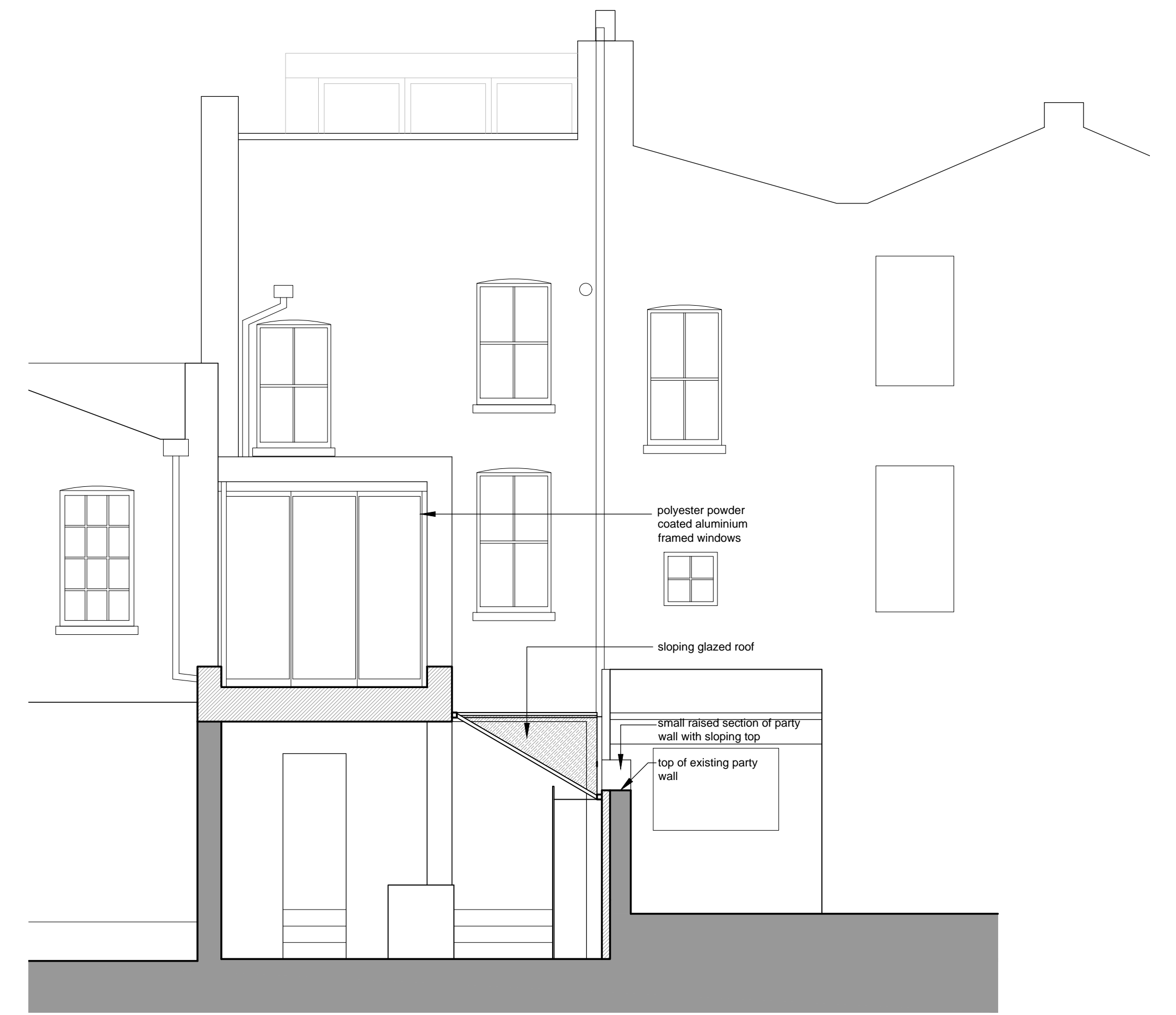
PROPOSED SECTION EE