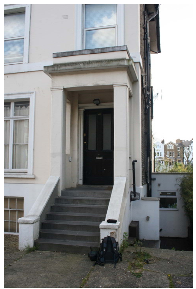
Front porch to No. 41