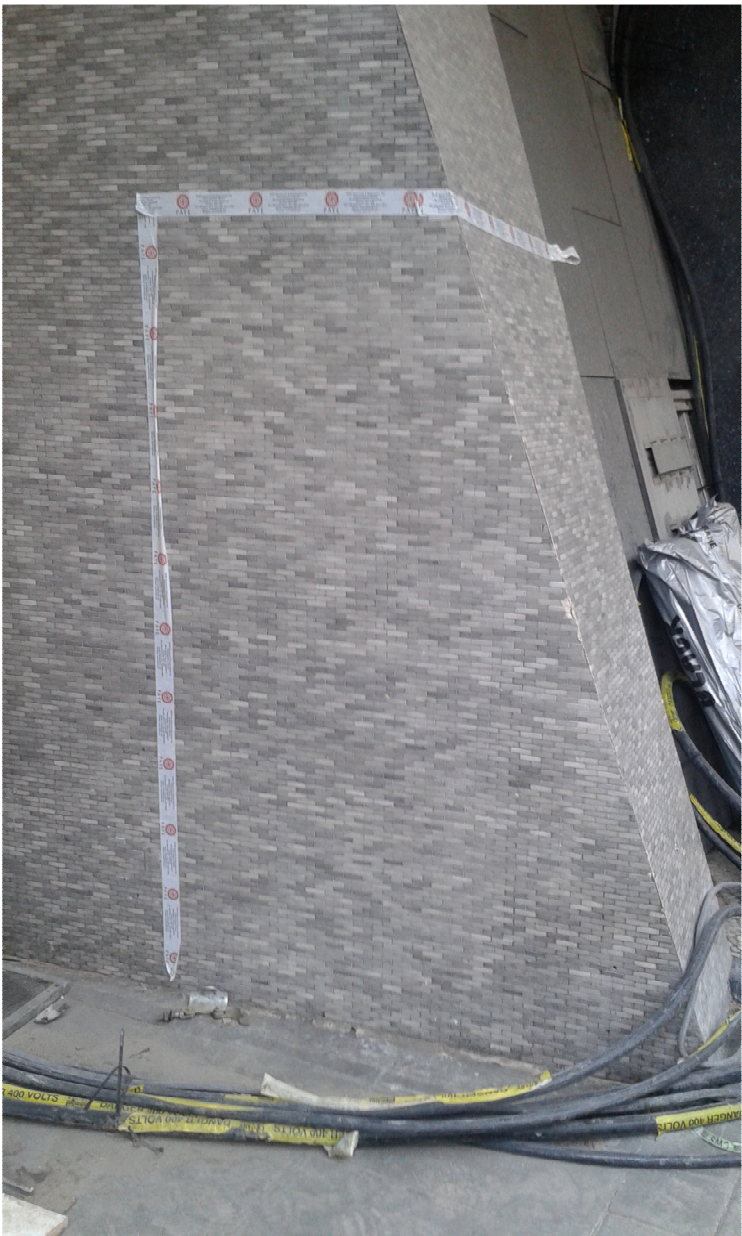
Sample 1. PAYE – The mosaic cleaning sample approx 2 x1.5m, was cleaned using Vulpex non ionic detergent and a DOFF superheated water clean.