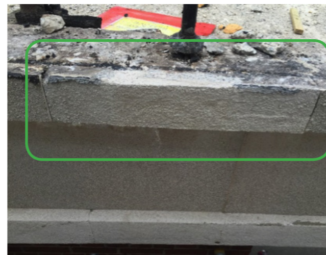
Concrete cill repair after