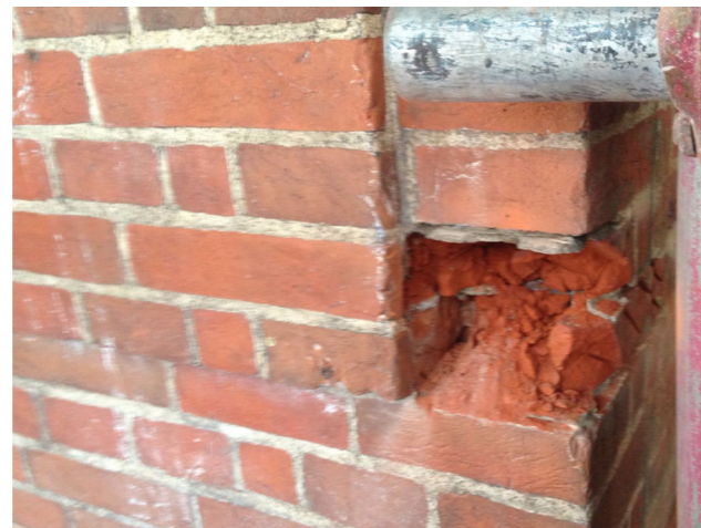
Masonry repair before