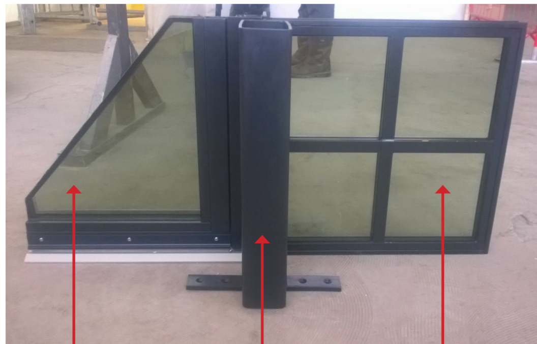
Ground Floor Glazing