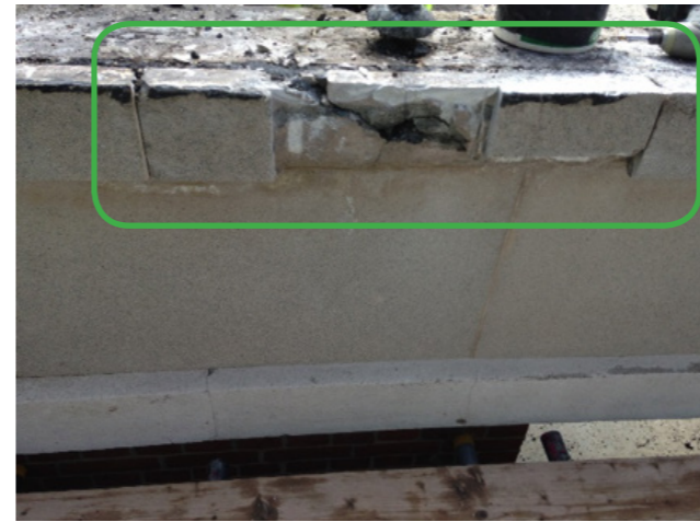
Concrete cill repair before