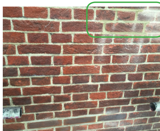
Masonry repair after