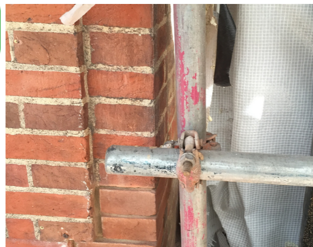
Masonry repair after