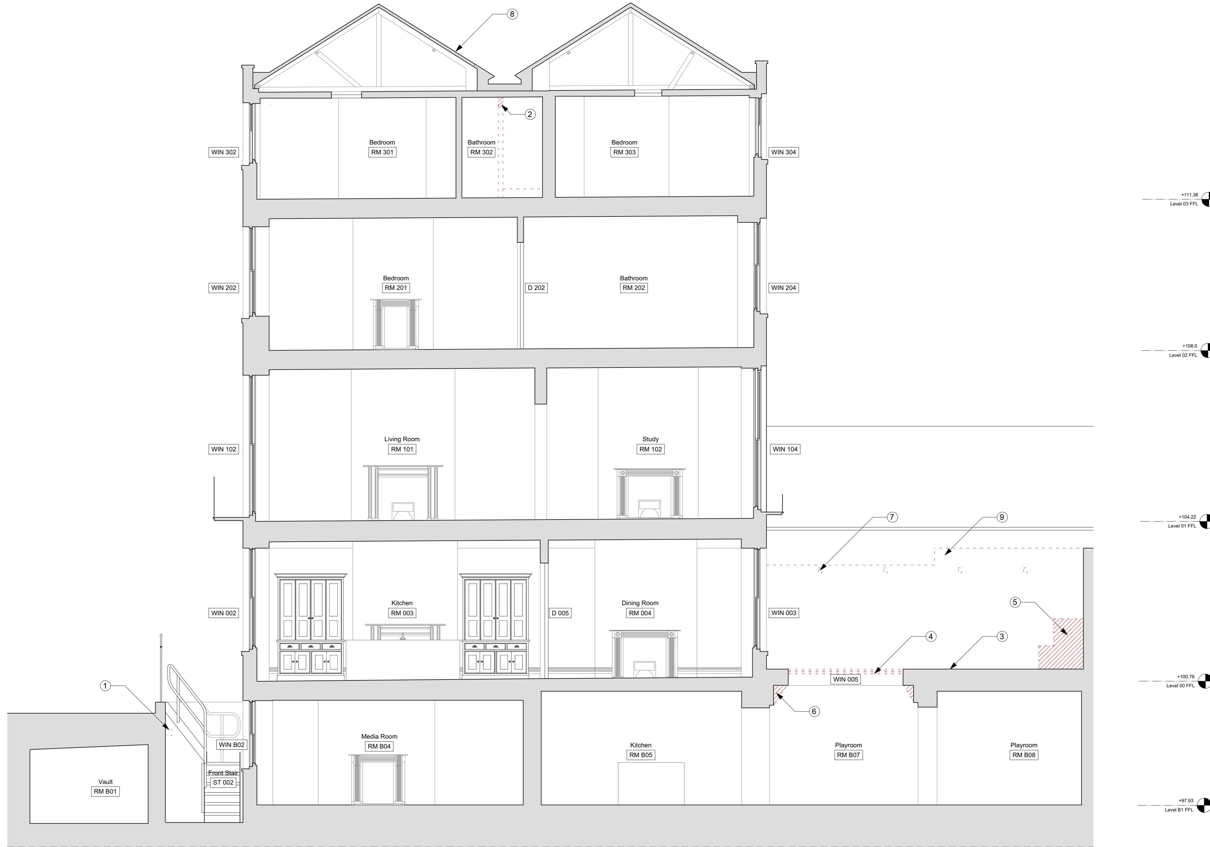
1 Section As Existing Scale 1:50 @ A1 / 1:100 @ A3