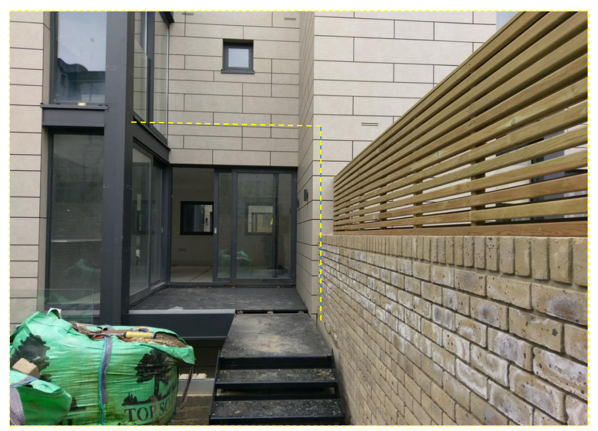
Photo.3 View back towards No.10 indicating area of infil extension.