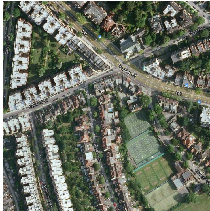
GOOGLE IMAGE - 74 CREDITON HILL, LONDON, NW6 1HR