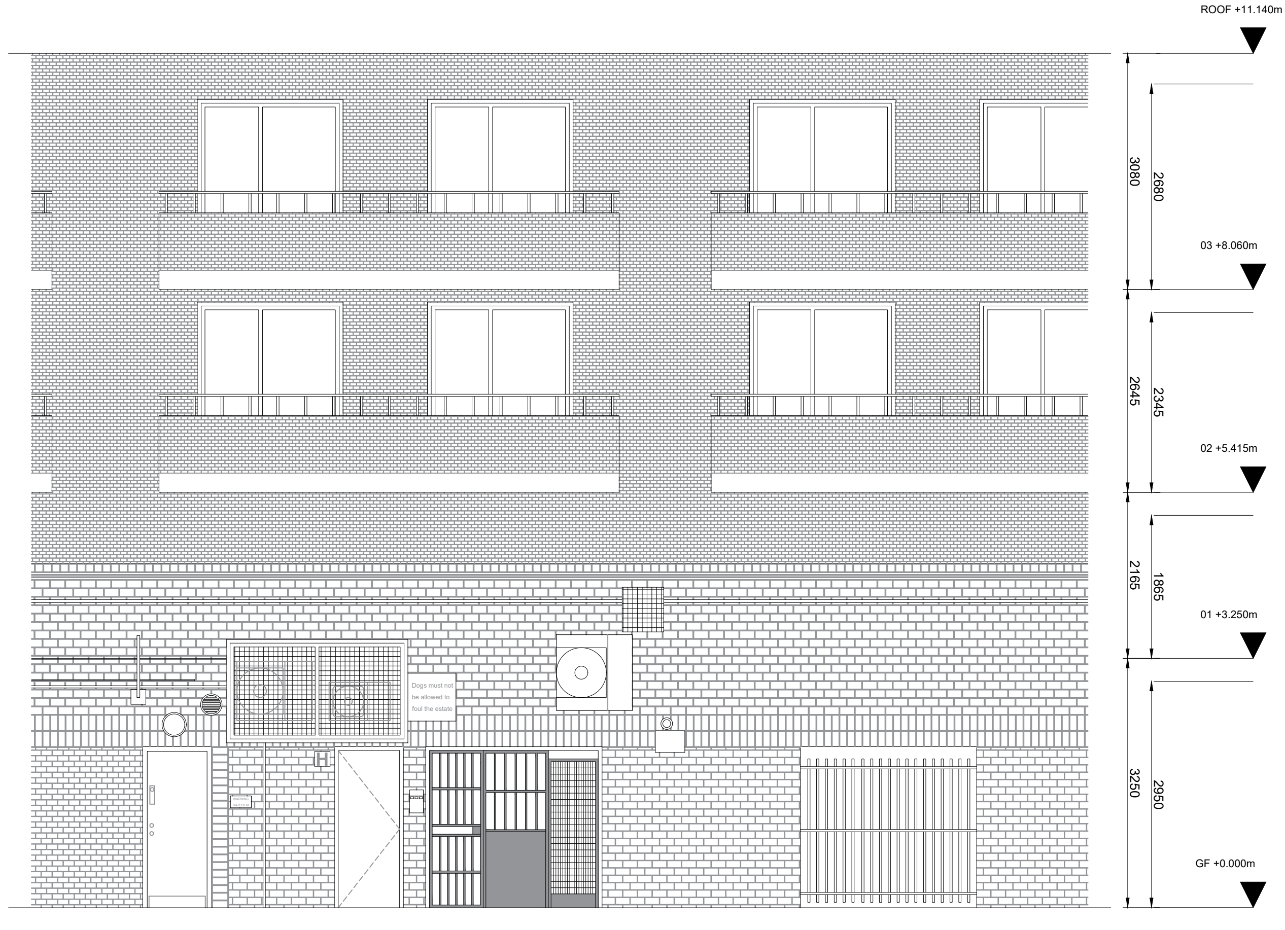
EXISTING BACK ELEVATION SCALE 1:50@A3