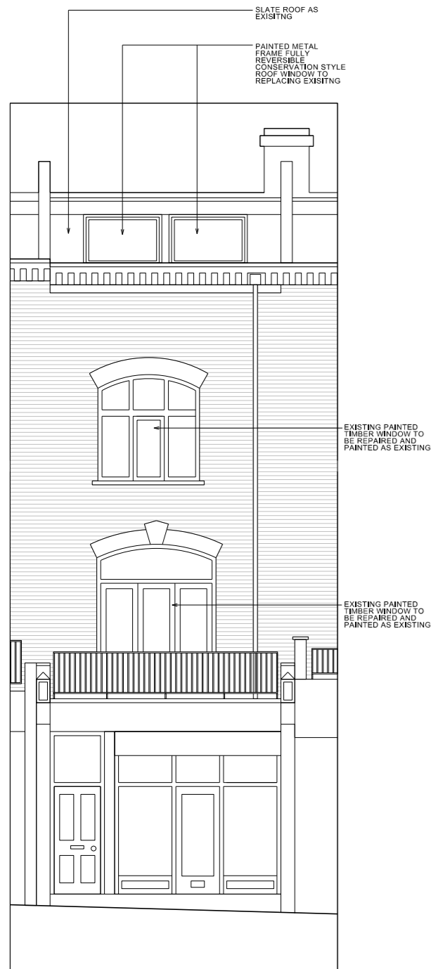
1/1623 PA 310 FRONT ELEVATION PROPOSED