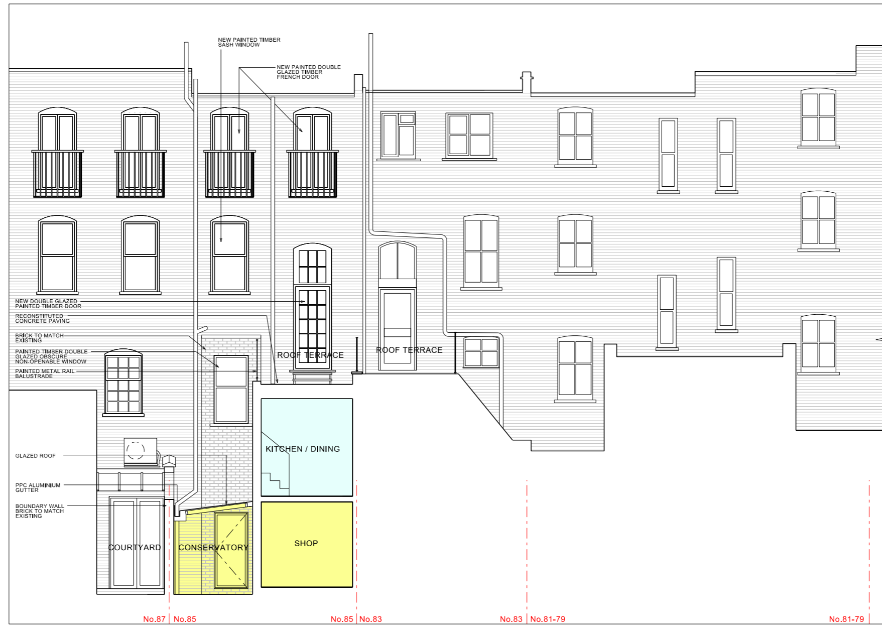
2/1623 PA 310 REAR SECTIONAL ELEVATION PROPOSED