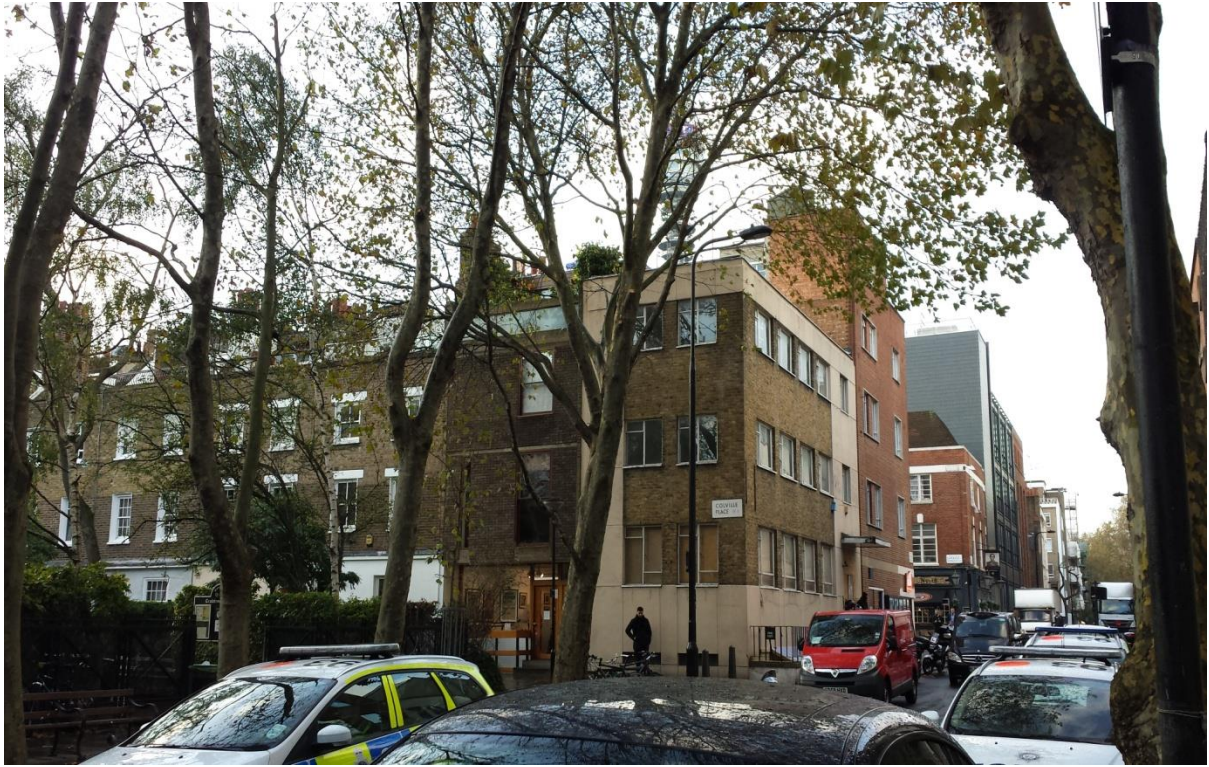
As above