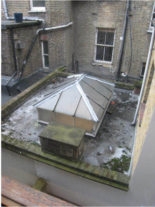
Rear of site – flat roof and rooflight