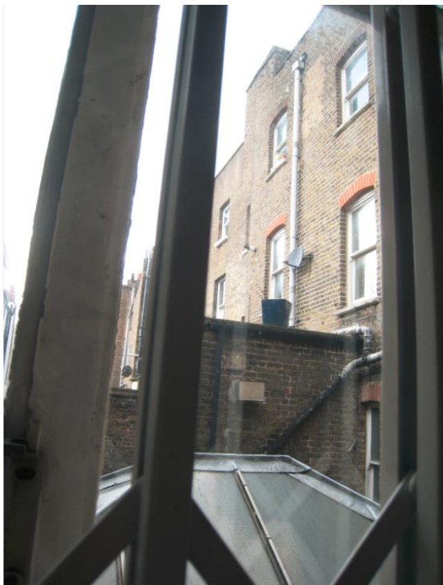
View from office window at 27-29 Whitfield St (site) towards existing lantern/roof light