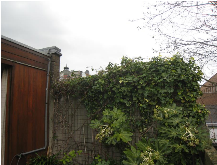
View from 1 Colville Place top terrace towards site