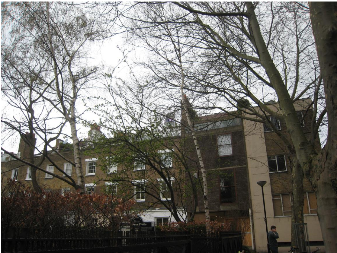
Colville Place elevation in context