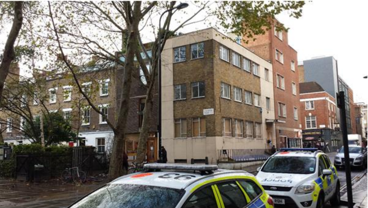
Front elevation – Colville Place