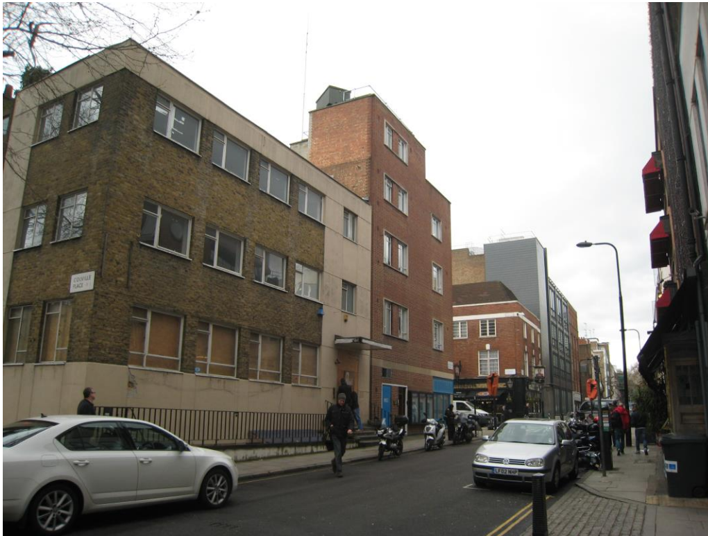
Whitfield Street elevation – view north towards 19 Godge Street