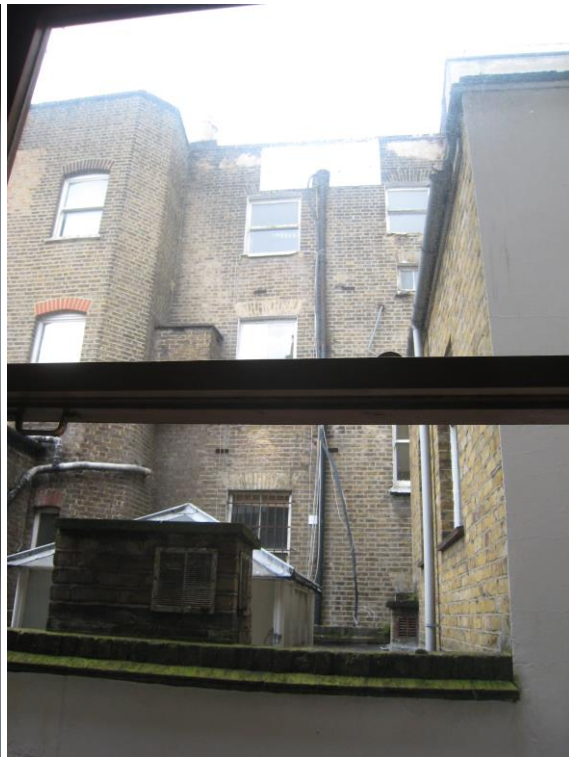
View from 1 Colville Place towards 2 nd floor rear flat roof and 1 st floor flat roof of site