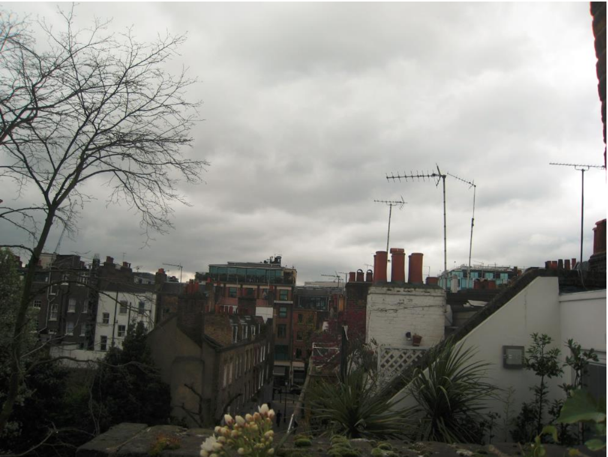
View 1 Colville Place front terrace down towards remainder of Colville Place terraces