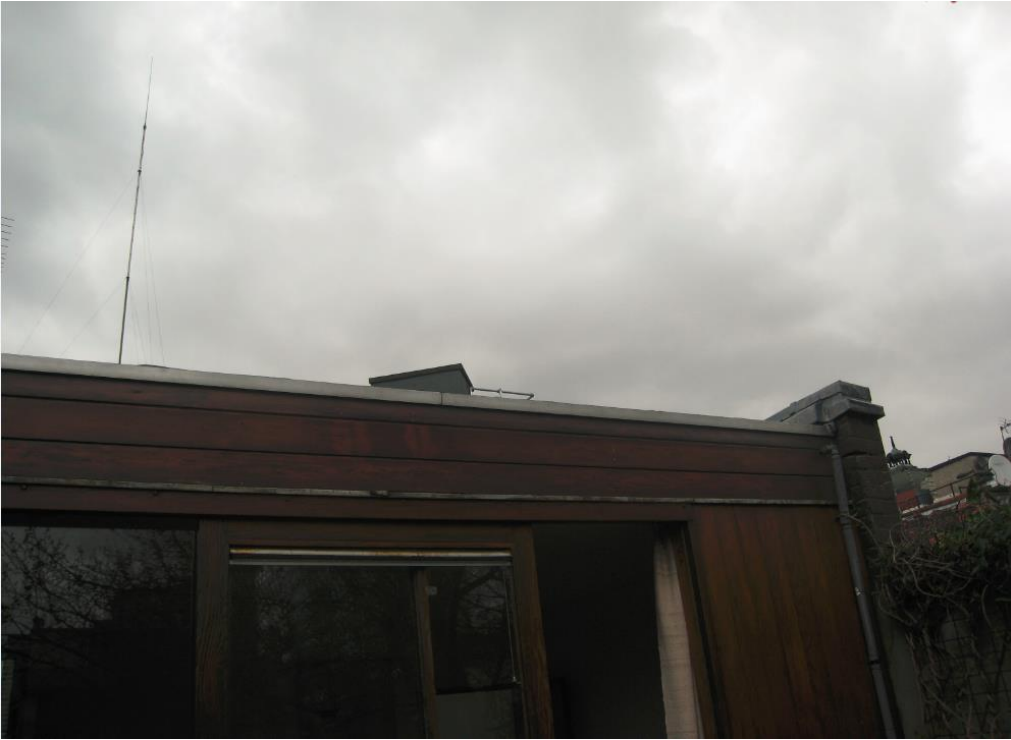
Glimpse of existing plant on roof of 19 Goodge Street from no. 1 Colville Place