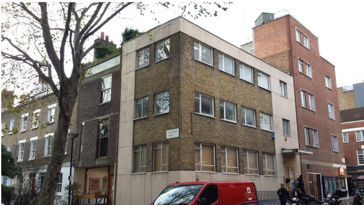
Corner of Colville /Whitfield (By Marc Dorfman)