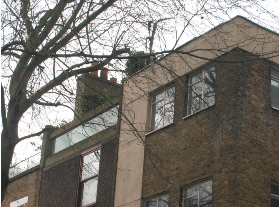
Front elevation – Colville Place