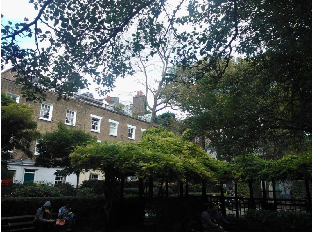
View from public gardens opposite Colville Place