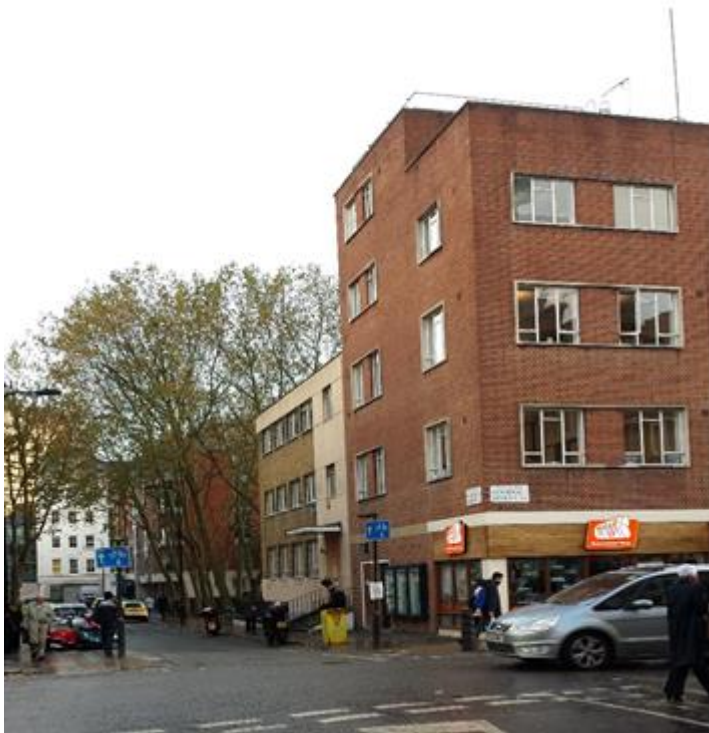
view from Goodge Street