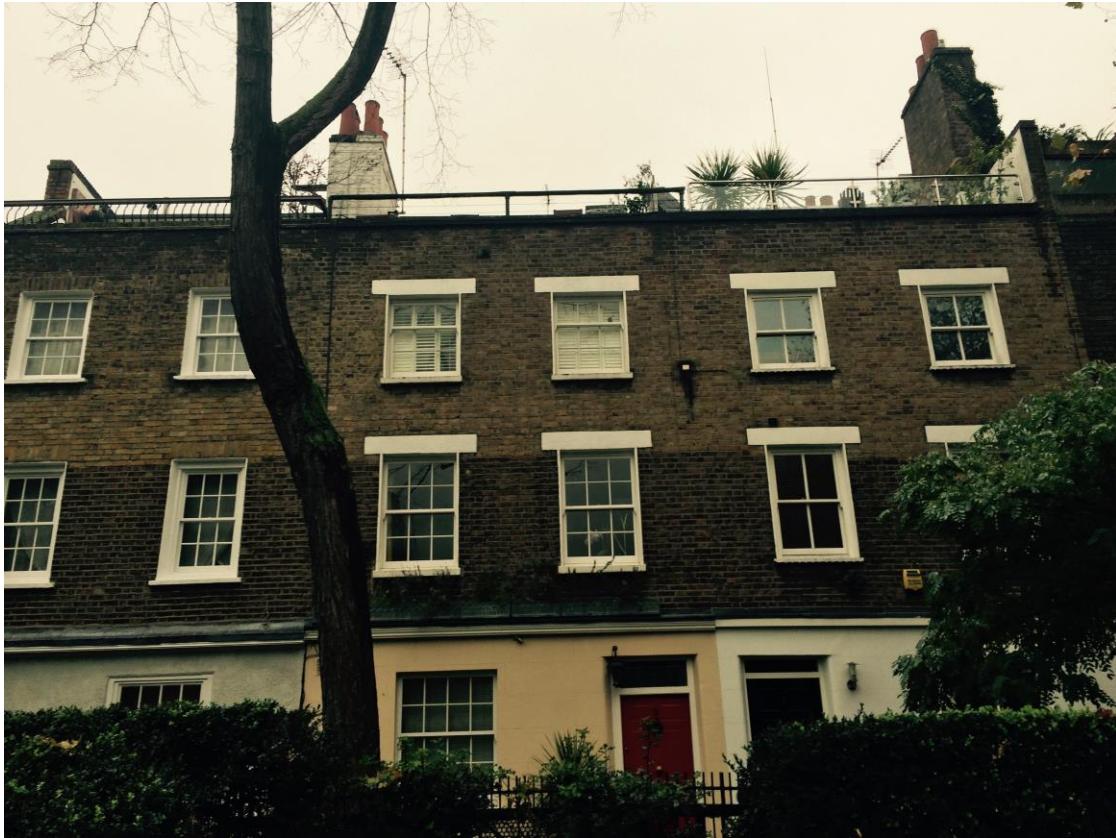
Other roof terrace balustrades along Colville Place