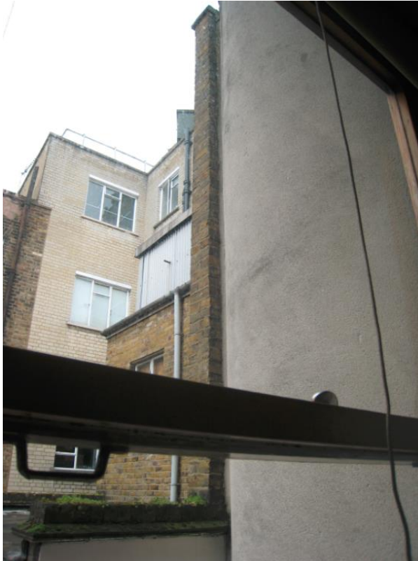
View from no. 1 Colville Place window towards existing plant on top of subject site