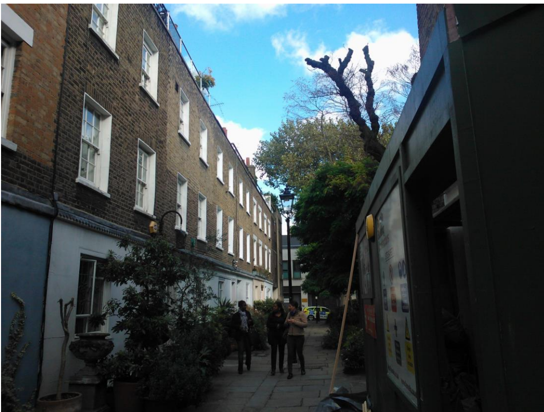
Oblique view from the west end of Colville Place towards the site