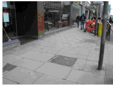
VIEW FROM EUSTON ROAD - LHS