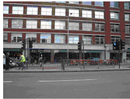
VIEW FROM EUSTON ROAD - FRONT ELEVATION