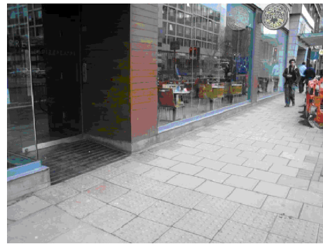
VIEW FROM EUSTON ROAD - LHS