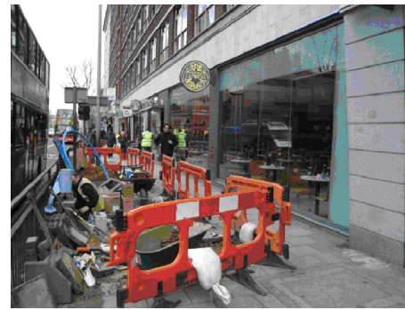
VIEW FROM EUSTON ROAD - RHS