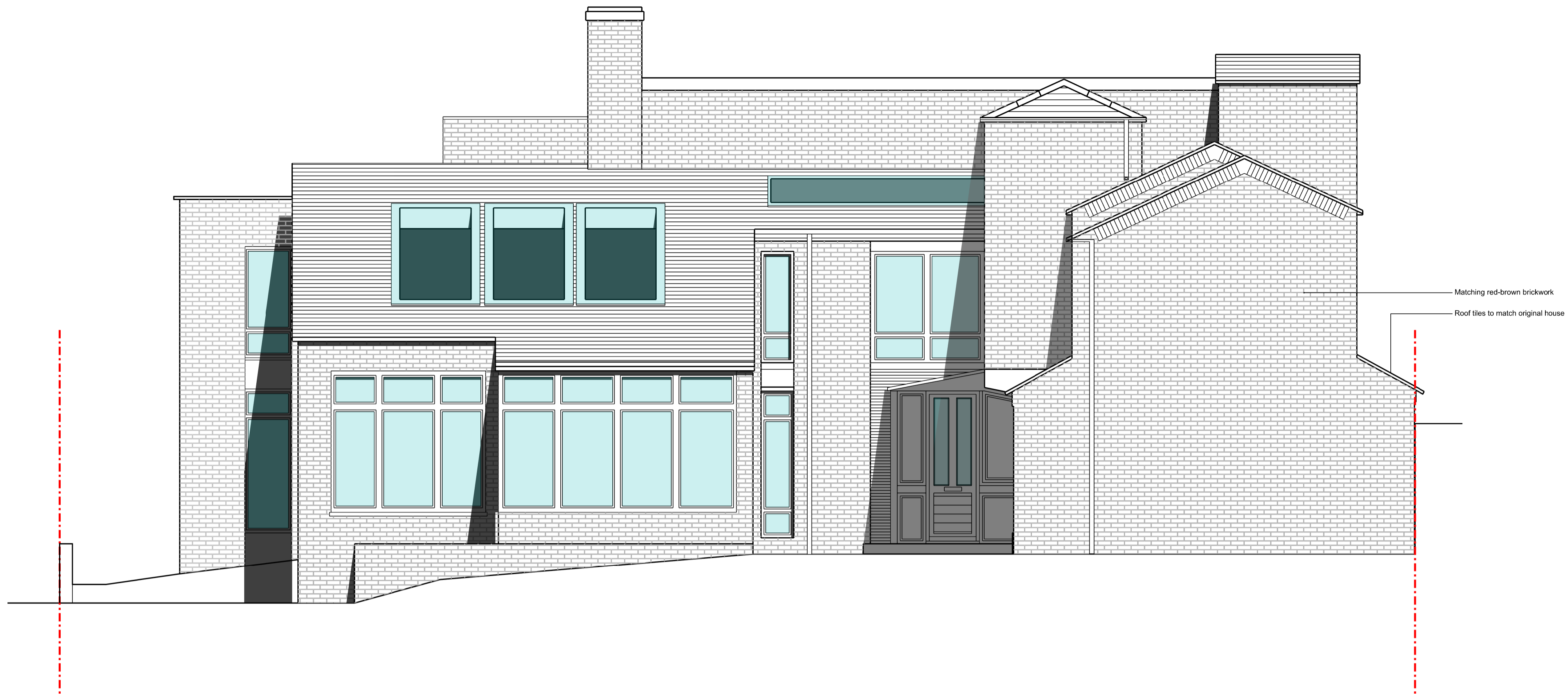
01 FRONT (SOUTH) ELEVATION AS PROPOSED KAM02_P_131 SCALE 1:50 @ A1

General Notes: Should any discrepancies be noted, please inform the Architect