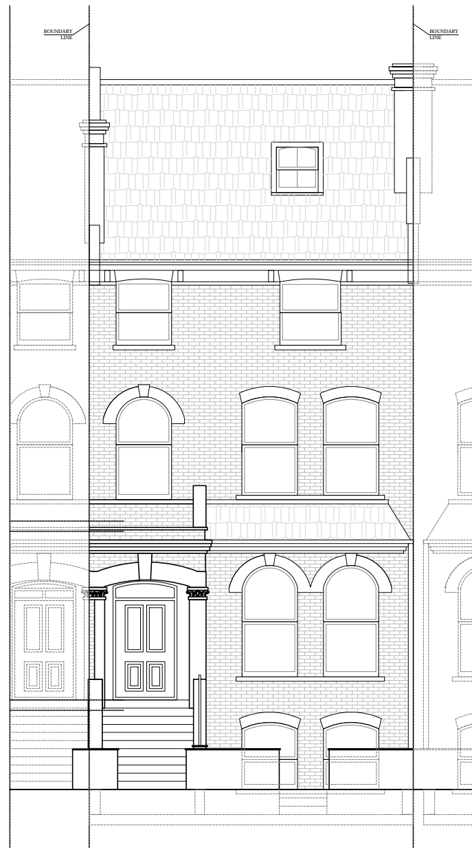
PRE-EXISTING FRONT ELEVATION