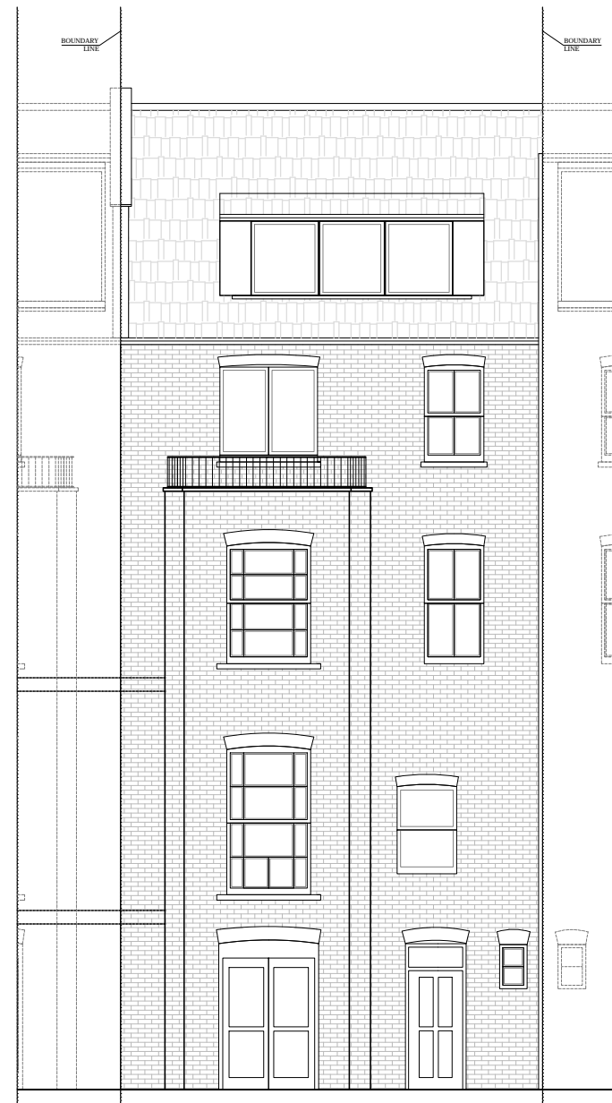
PRE-EXISTING REAR ELEVATION