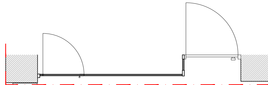
2 Proposed Plan 1:50