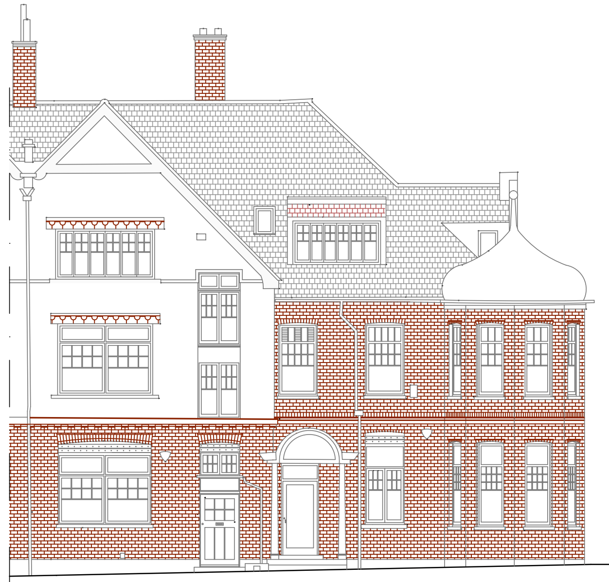
HEATH DRIVE - LONDON NW3 Front Elevation