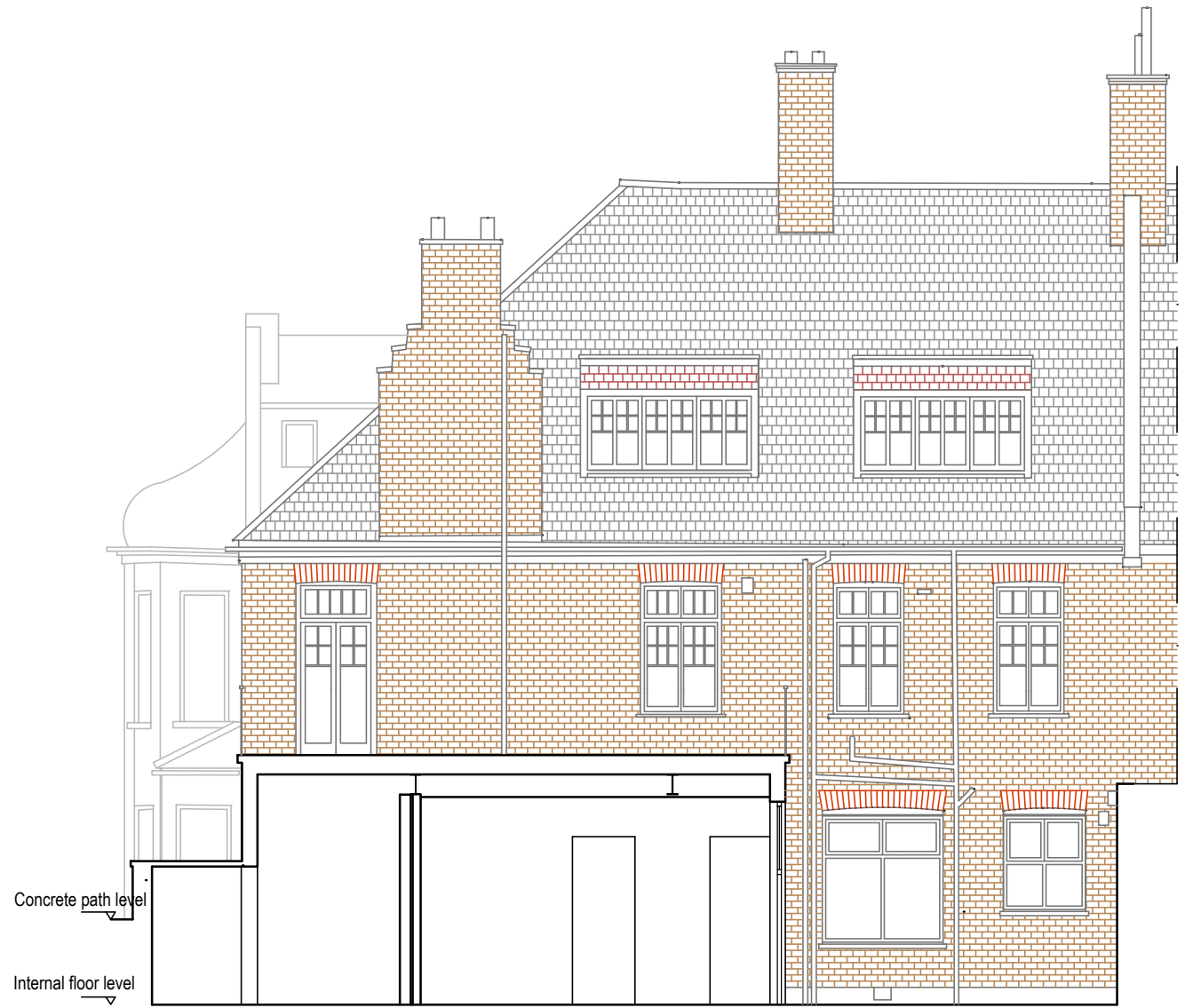
HEATH DRIVE - LONDON NW3 Section 2-2 - Existing