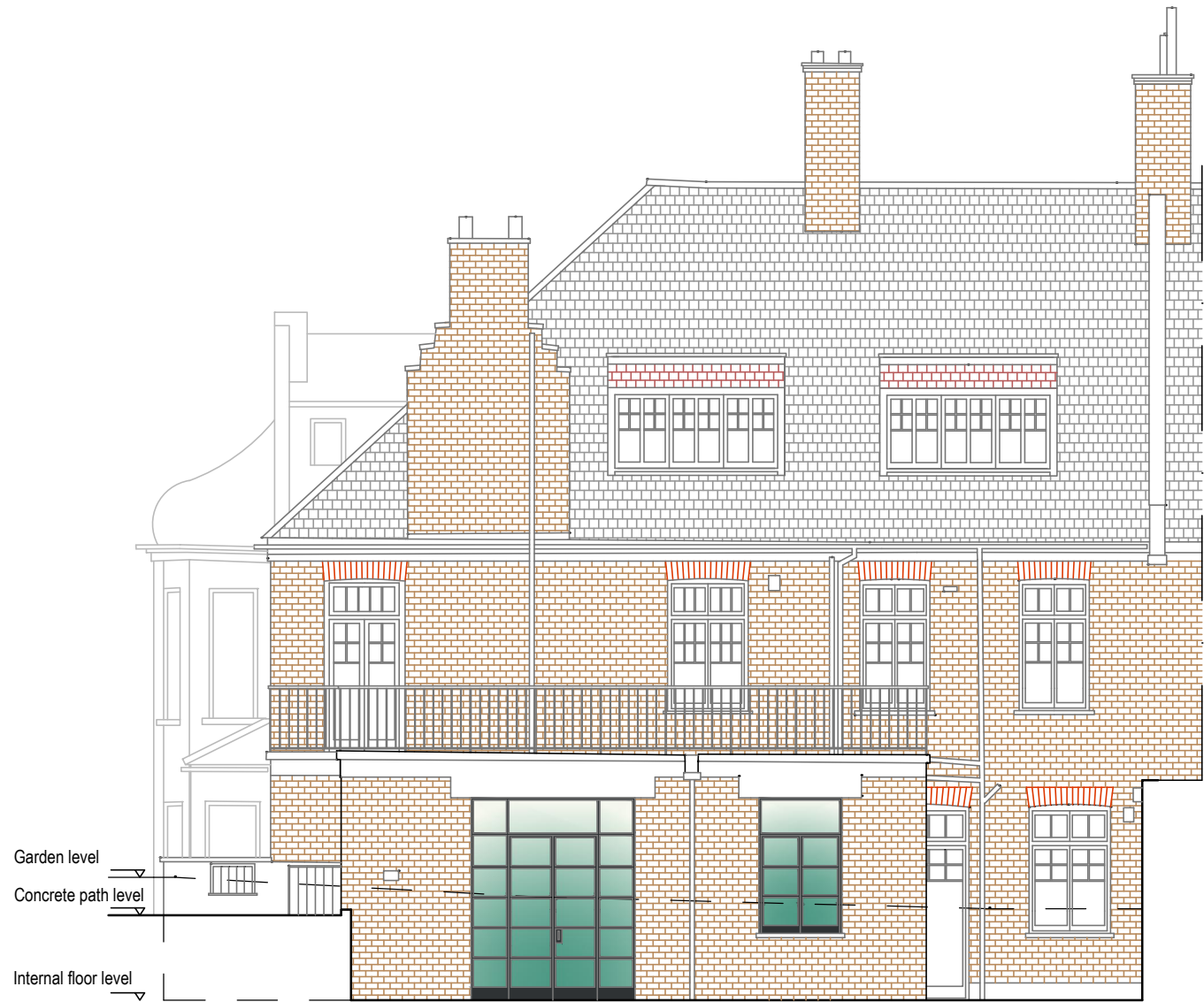
HEATH DRIVE - LONDON NW3 Elevation 1-1 - Proposed