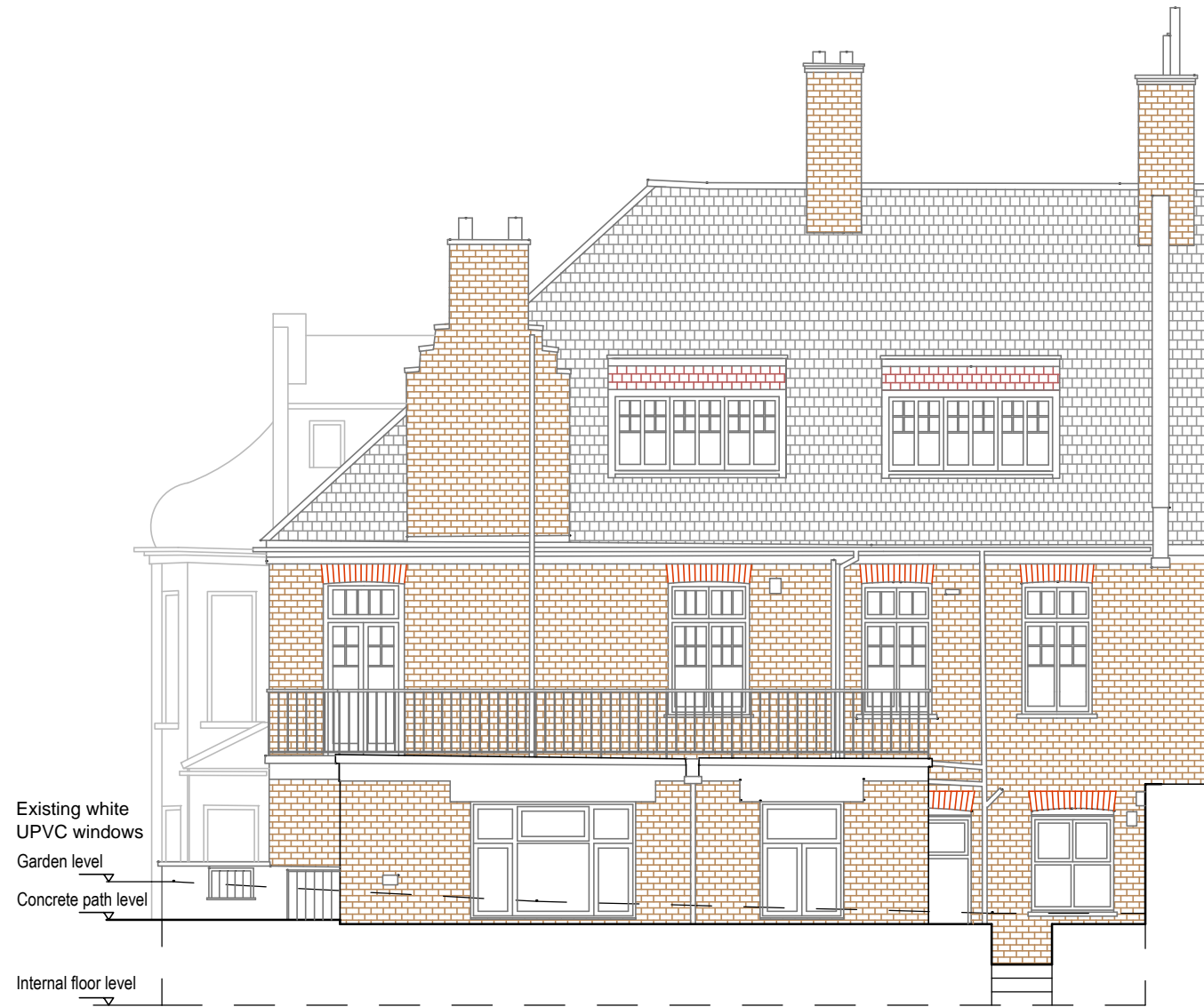
HEATH DRIVE - LONDON NW3 Elevation 1-1 - Existing