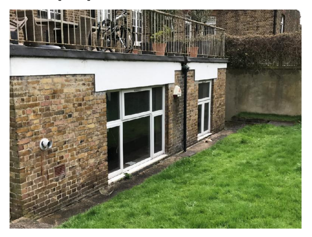
Photograph 02 - Rear elevation - indicating the UPVC windows to be removed.

The proposal for this application is to remove the rear UPVC windows and timber door. The proposed windows W1 and W2 (as noted on drawing 370410-01 and 370410-02) as shown in the photograph below are to be replaced with Aluminium Crittal doors and windows. The door W5, on the southern elevation, is also proposed to be replaced with a crittal style door, to replace the existing. Windows W3 and W4 are also currently UPVC. These are to be replaced with a timber framed door (W3) and window (W4), in keeping with the style and materials of the existing building.