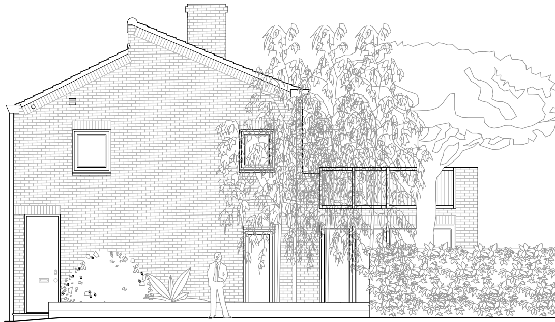
SOUTH-EAST ELEVATION WITH GARDEN