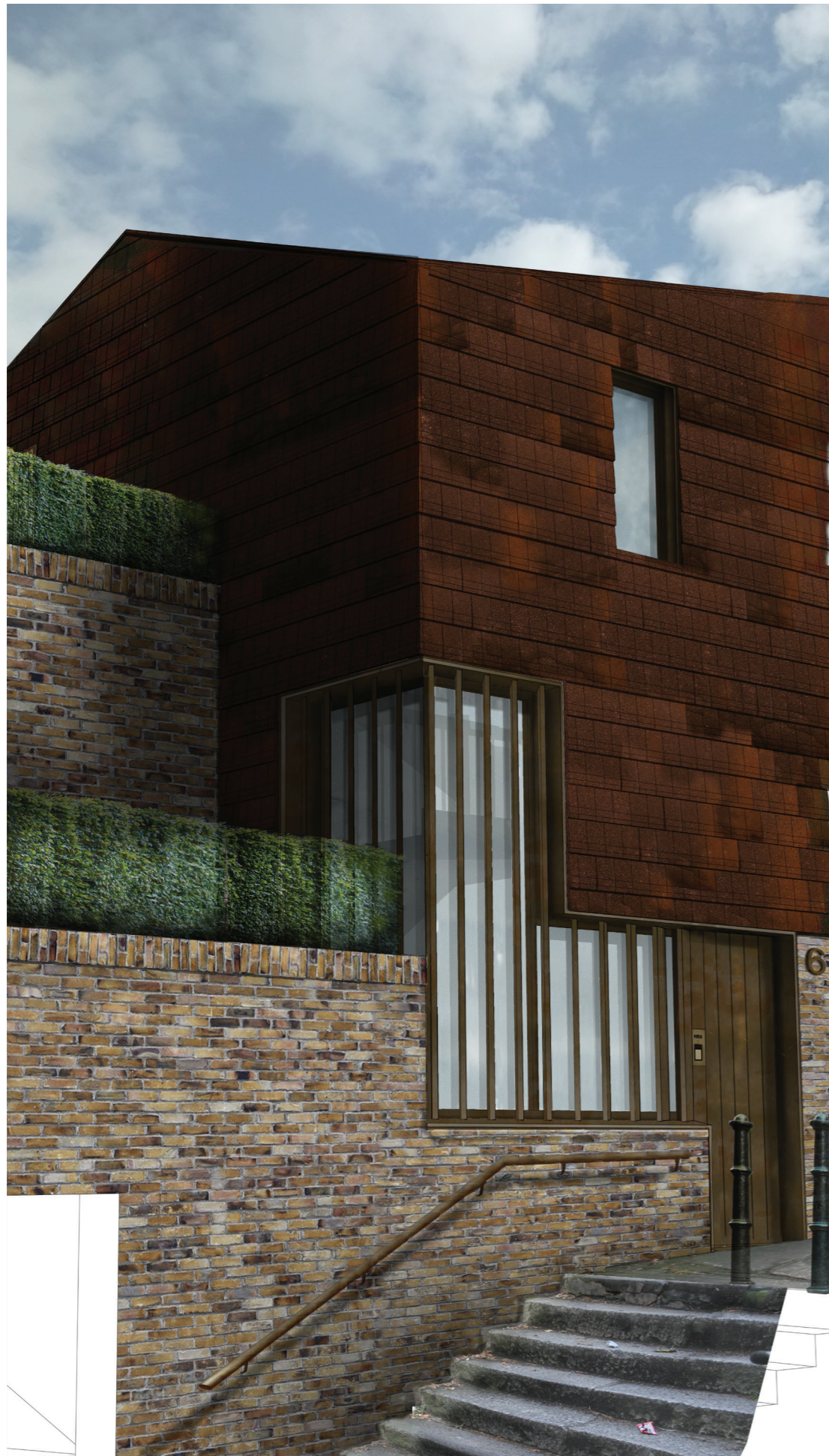
Rendered Front Elevation