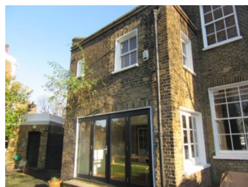
8. Existing Side Elevation of Rear Extension