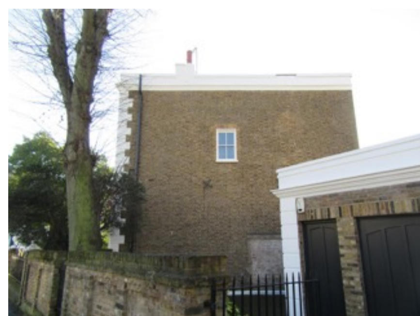
5. Existing Side Elevation