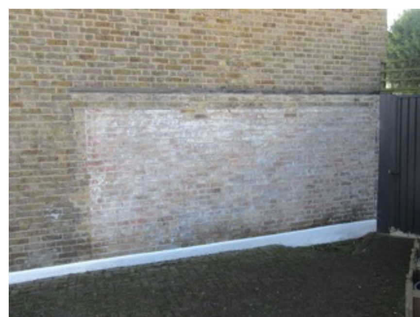
6. Existing Side Elevation showing previous structure