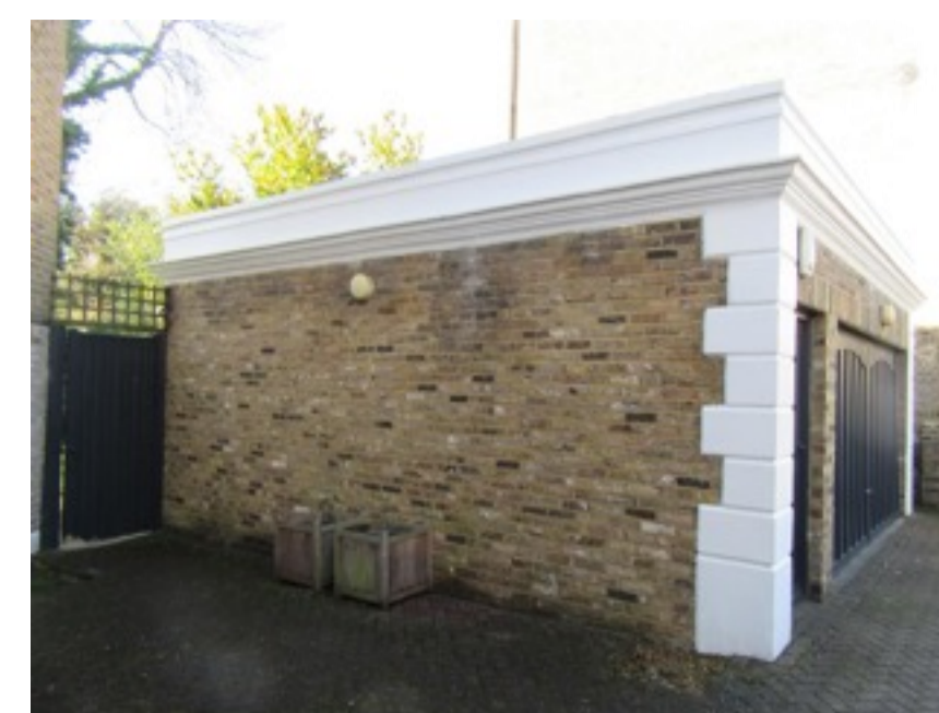
4. Existing side Elevation of garage