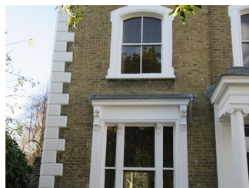
2. Existing Windows