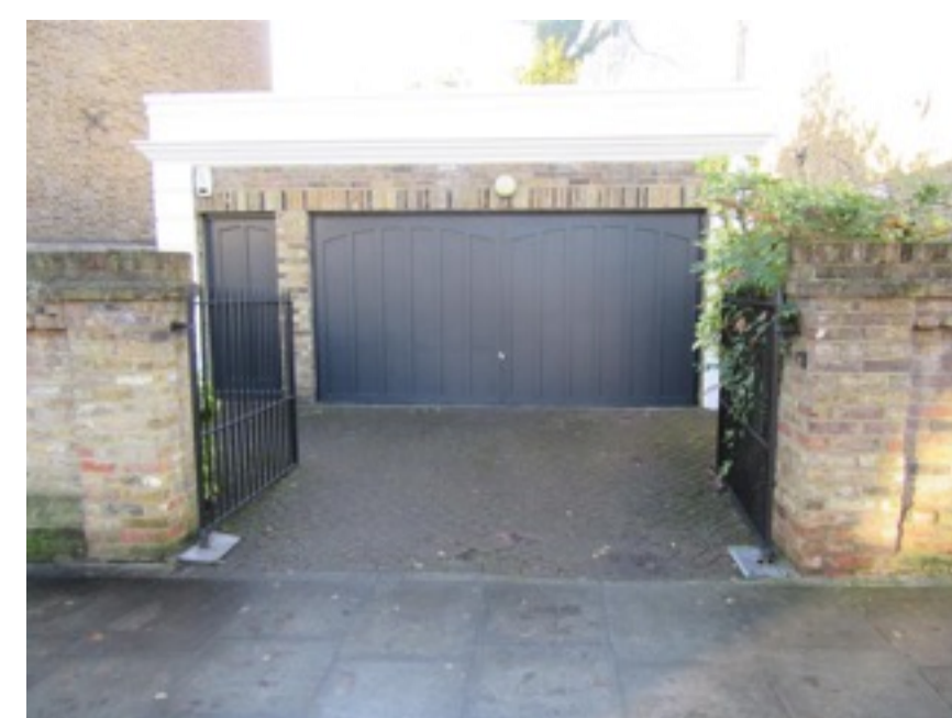
3. Existing Front Elevation of garage