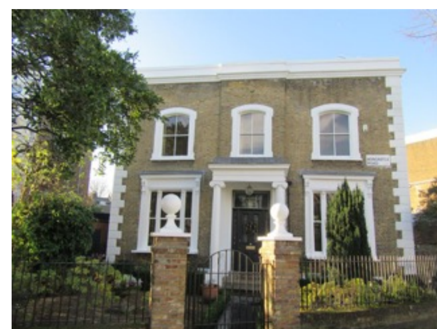
1. Existing Front Elevation