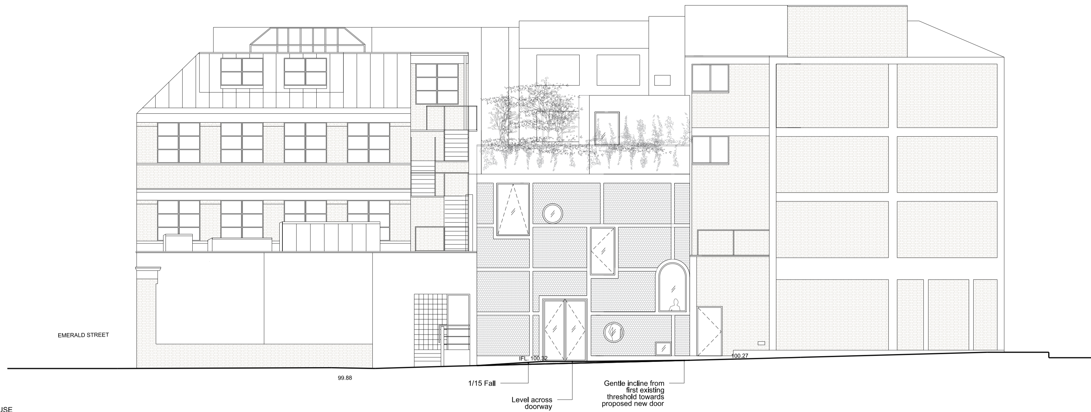
1 PROPOSED ELEVATION OF BEDFORD HOUSE SCALE 1:200 @A3