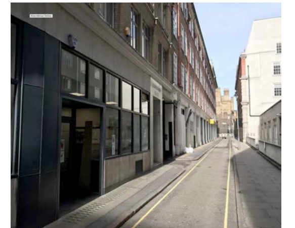
Photo Reference of Existing Shopfront