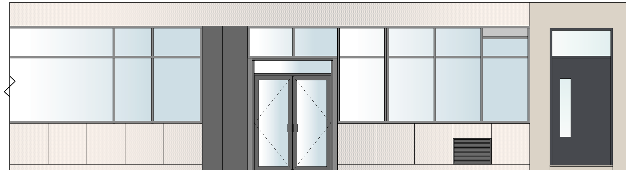
Existing Shopfront Brownlow Street