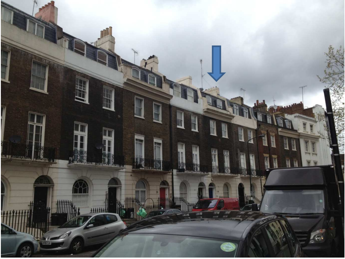
Top – 31 Mornington Crescent; Bottom – Mornington Crescent looking north