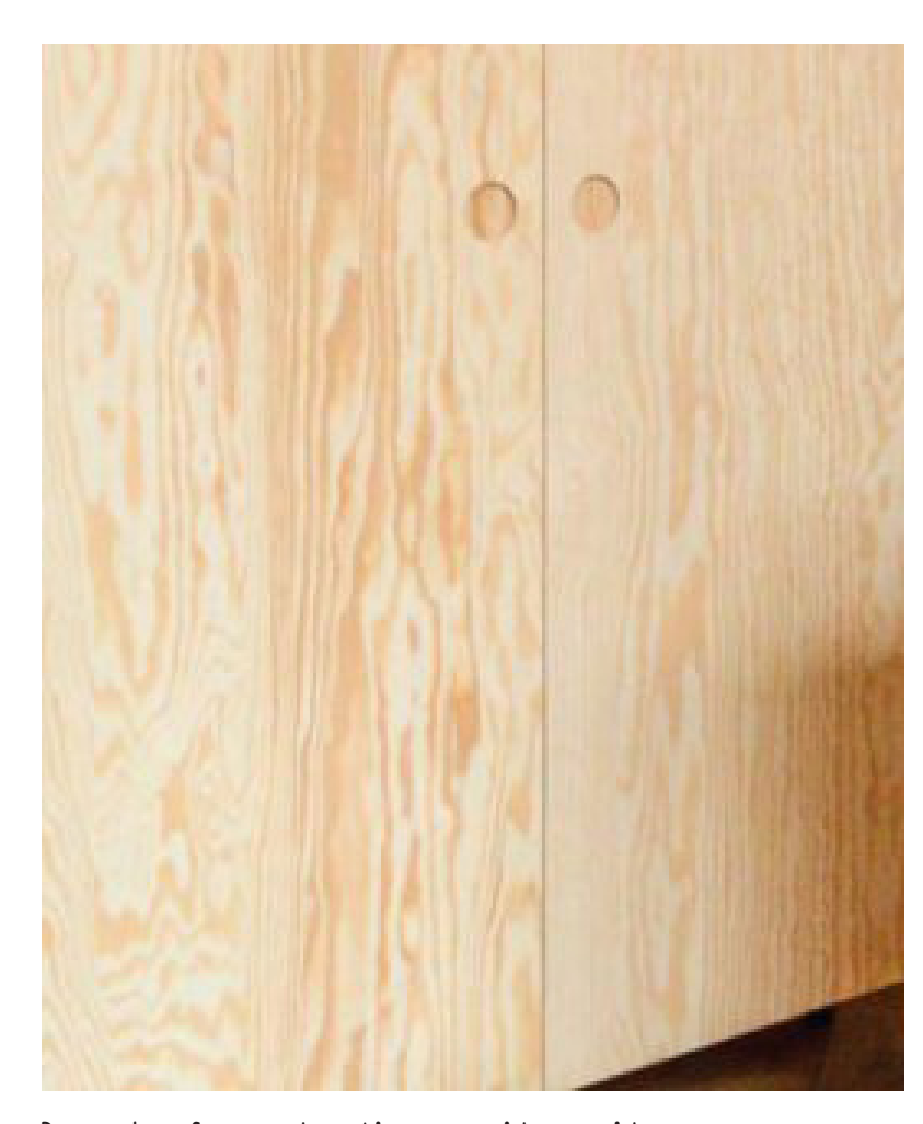
Bespoke free-standing vanity unity constructed of pine plywood to tie in with kitchen.