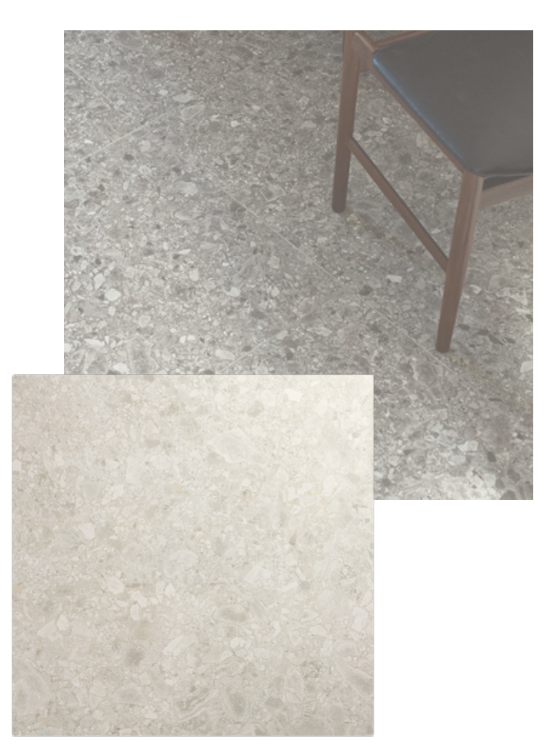
Light grey terrazzo floor tiles