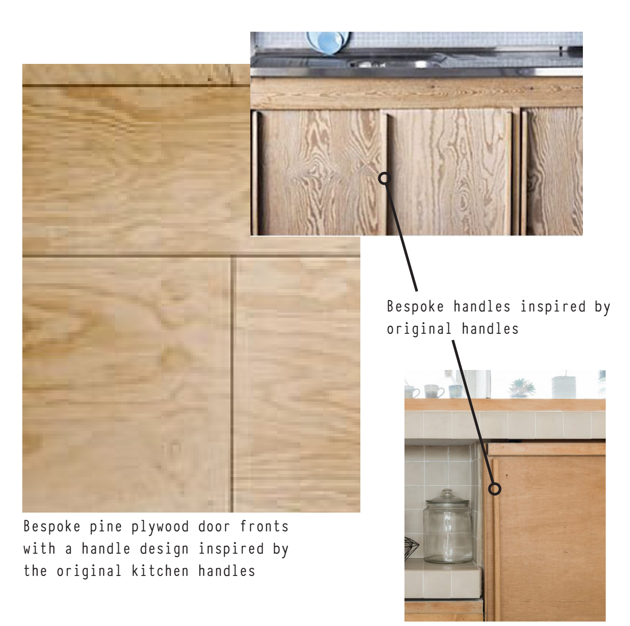
Original kitchen doors

We would like to remove the current fixtures and fitting, none of which are original to the building and replace with a modern integrated kitchen that references Neave Brown's original kitchen design. No interior or structural walls will be altered.