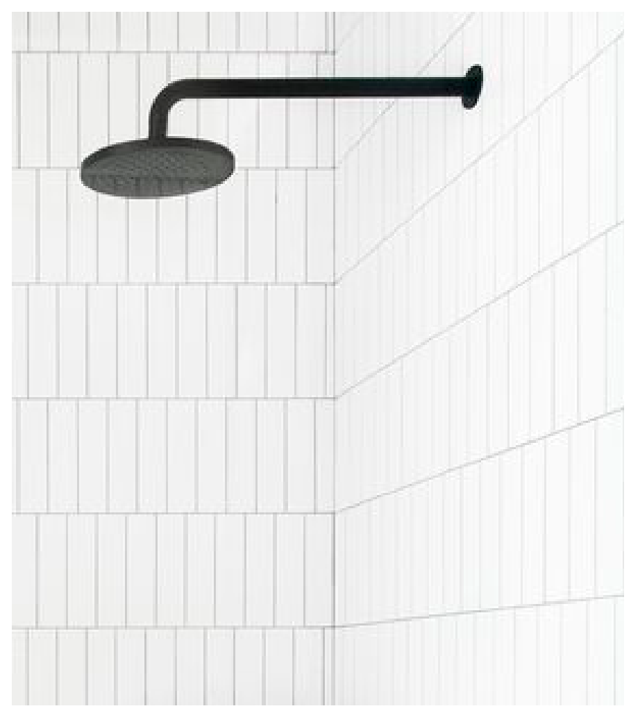
Simple white architectural tiles and modern matte black fixtures

The current bathroom is currently dated, damp and moldy. We would like to remove all fixtures and fittings (sink, toilet, show tray and tiles) and replace with modern fittings. None of the current tiles or fixtures are original to the building and we suspect the bathroom was last upgraded in the 1990s or early 2000s. This is an aesthetic improvement and no structural walls will be altered.