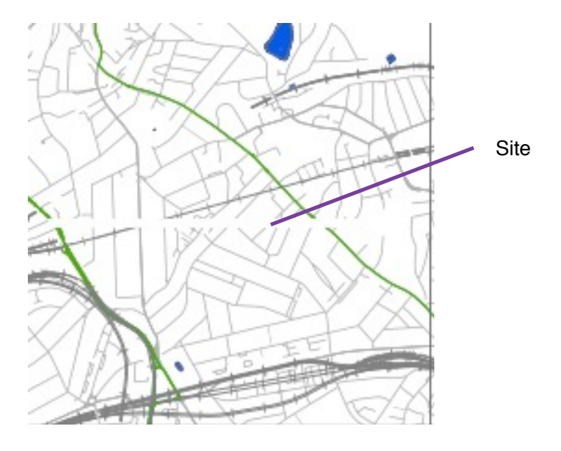
Figure 15 - Surface Water Flooding