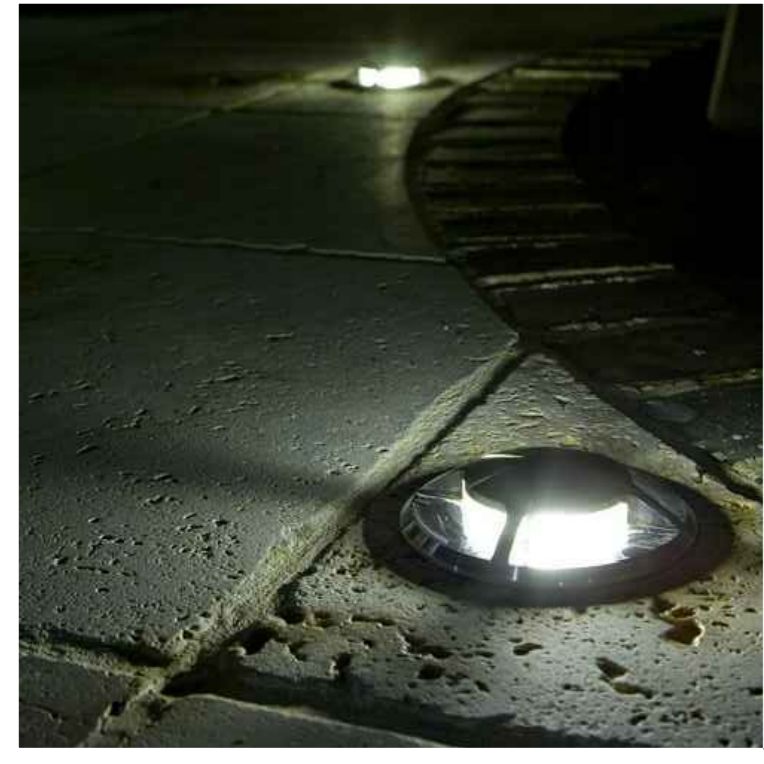
a Proposed road mounted light fitting