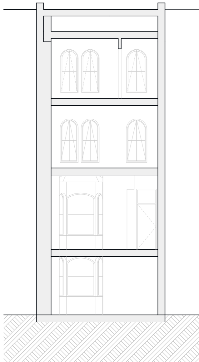
02 EXISTING TRANSVERSAL SECTION 02 1:100