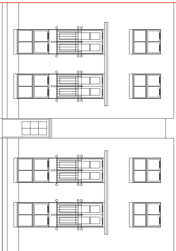
FRONT ELEVATION (EXISTING)

EXISTING ALUMINIUM WINDOWS AND DOORS TO BE REPLACED