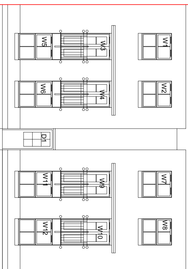
FRONT ELEVATION (PROPOSED)

PROPOSED ALUMINIUM DOUBLE GLAZED WINDOW AND BALCONY DOORS TO MATCH THE EXISTING.