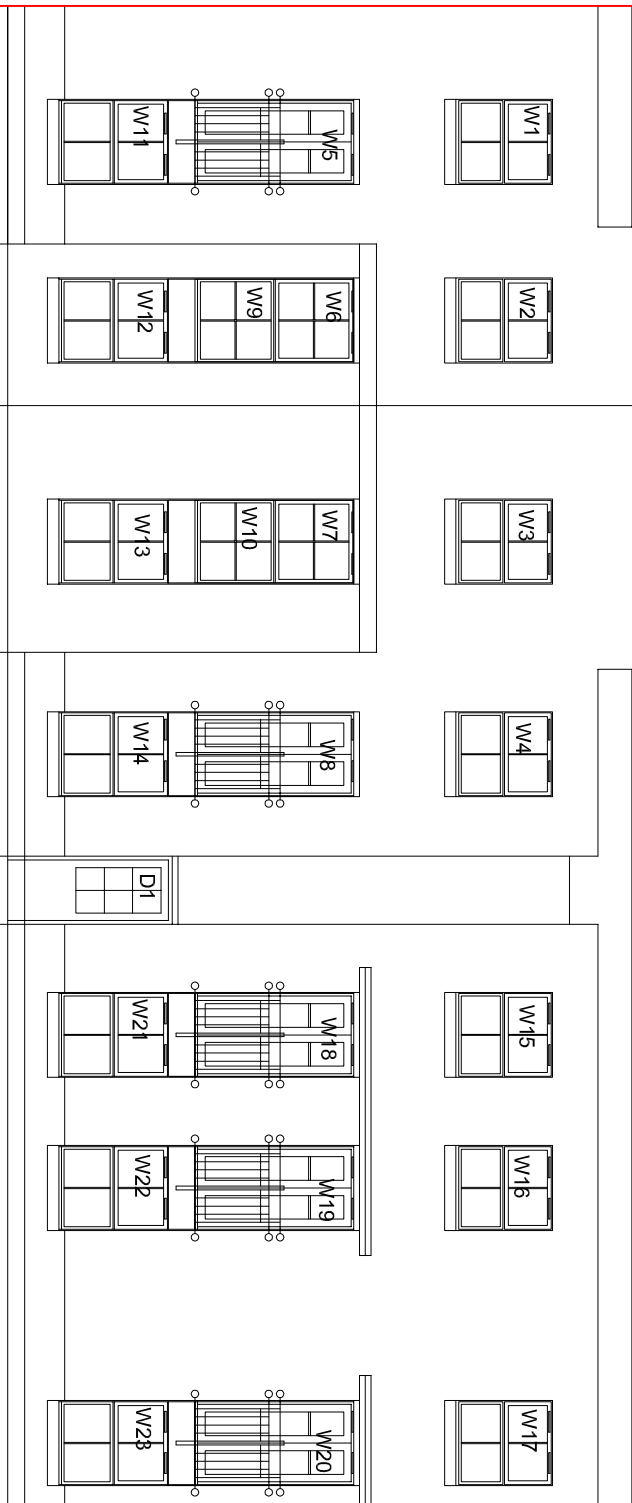
FRONT ELEVATION (PROPOSED)

PROPOSED ALUMINIUM DOUBLE GLAZED WINDOW AND BALCONY DOORS TO MATCH THE EXISTING.