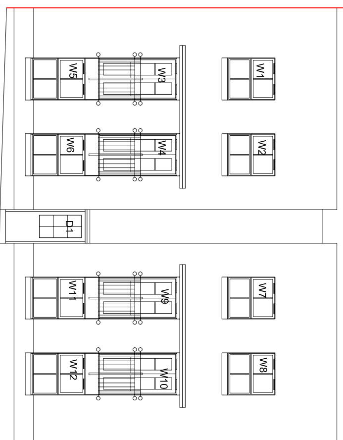
FRONT ELEVATION (PROPOSED)

PROPOSED ALUMINIUM DOUBLE GLAZED WINDOW AND BALCONY DOORS TO MATCH THE EXISTING.