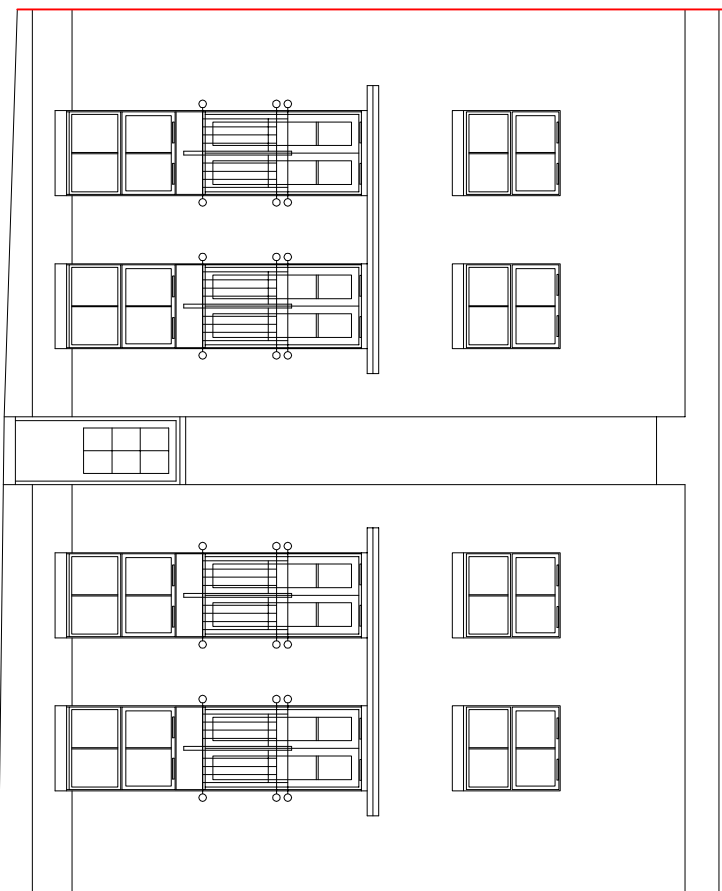
FRONT ELEVATION (EXISTING)

EXISTING ALUMINIUM WINDOWS TO BE REPLACED