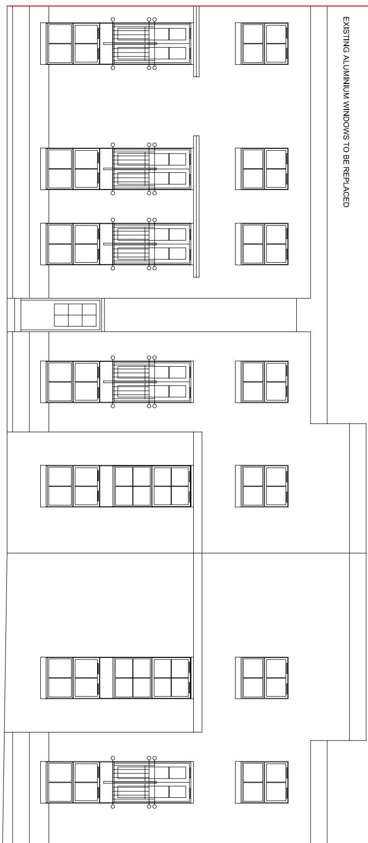
FRONT ELEVATION (EXISTING)

EXISTING ALUMINIUM WINDOWS TO BE REPLACED