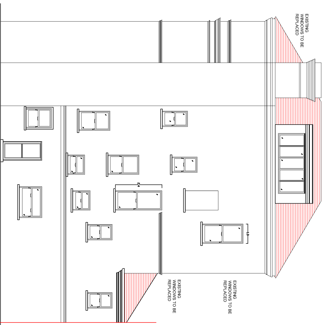
RIGHT SIDE ELEVATION (Existing)