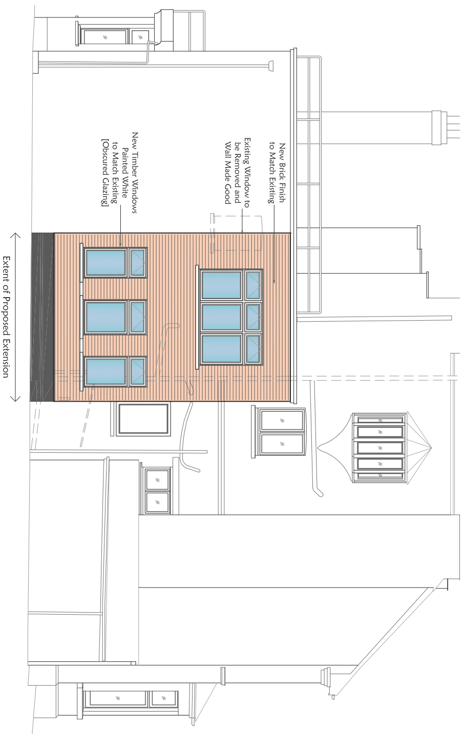
SIDE ELEVATION [EAST] AS PROPOSED - 1:100@A3