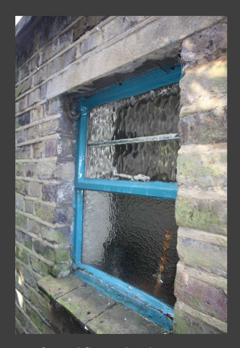
View of ground floor steel window to rear WG.02