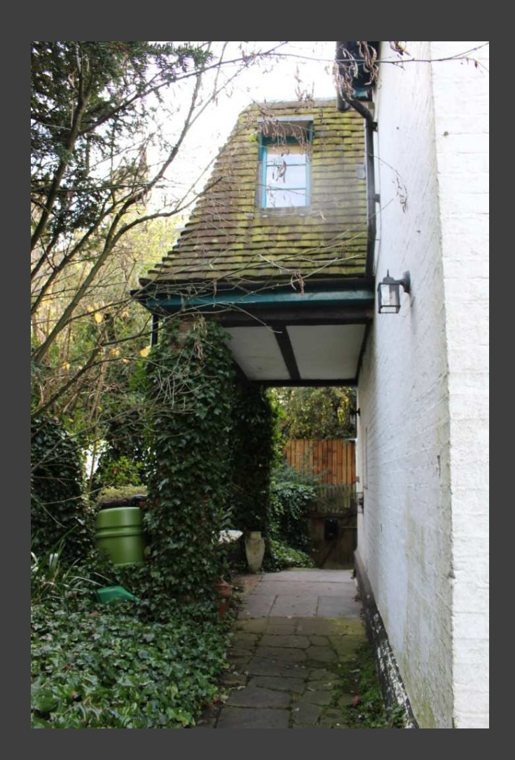
View of side extension showing steel window W1.05