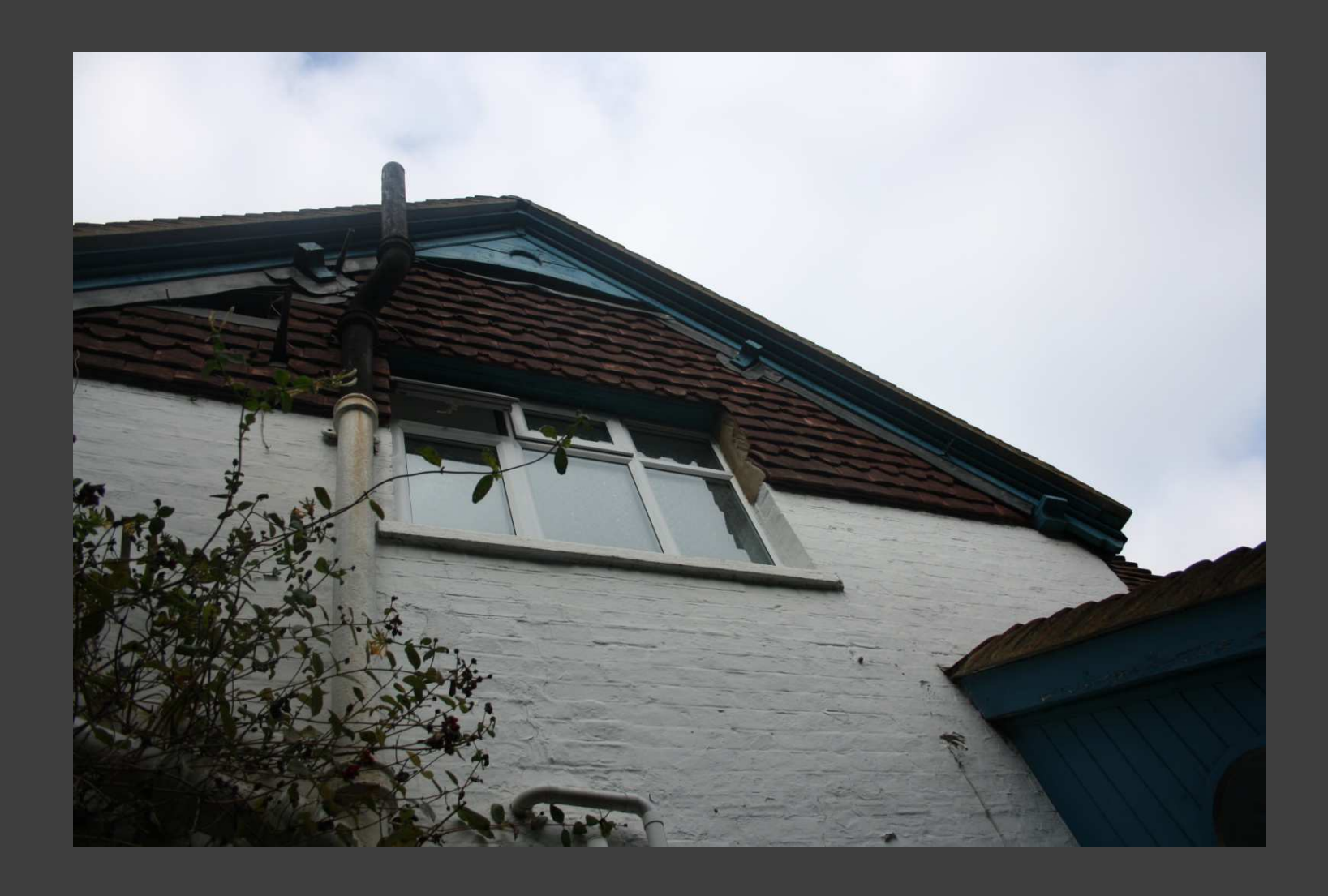
View of double glazed upvc window to rear W1.03