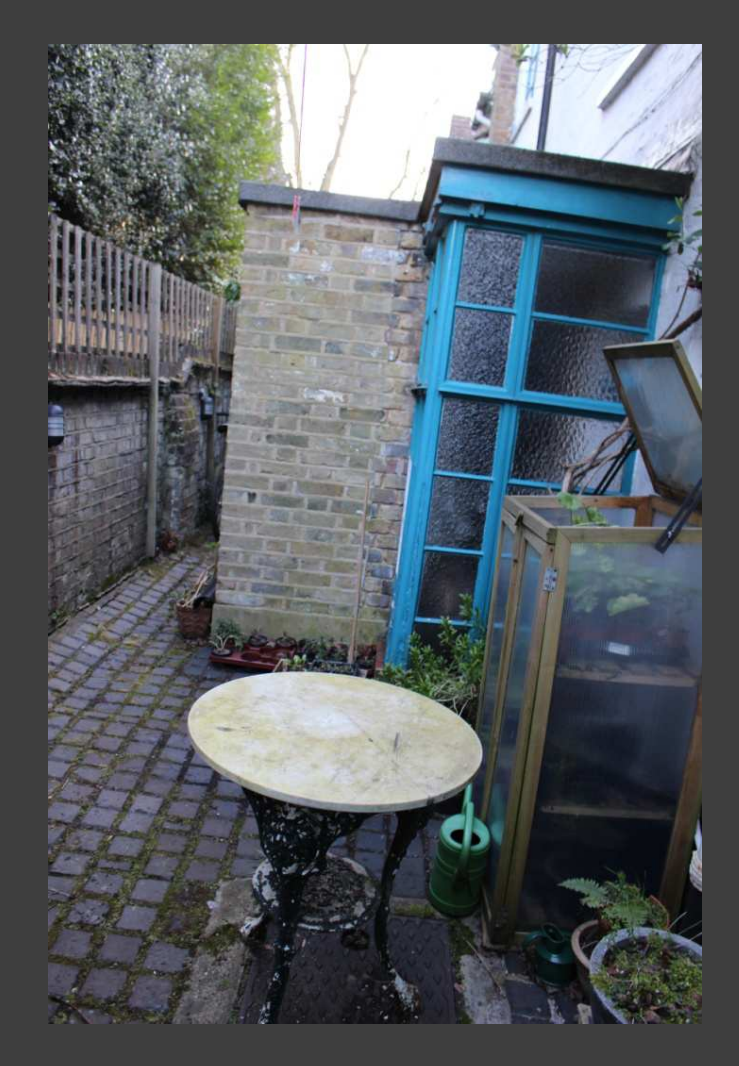
View of rear single story extension showing steel window, WG.03 and existing flat roof.