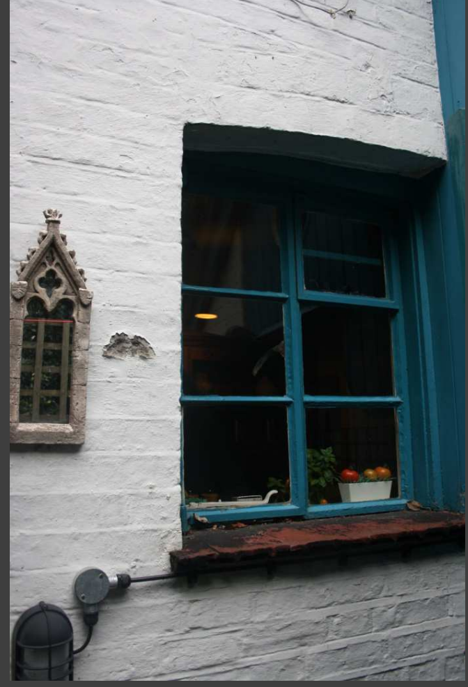
View of first floor steel window to rear W1.01