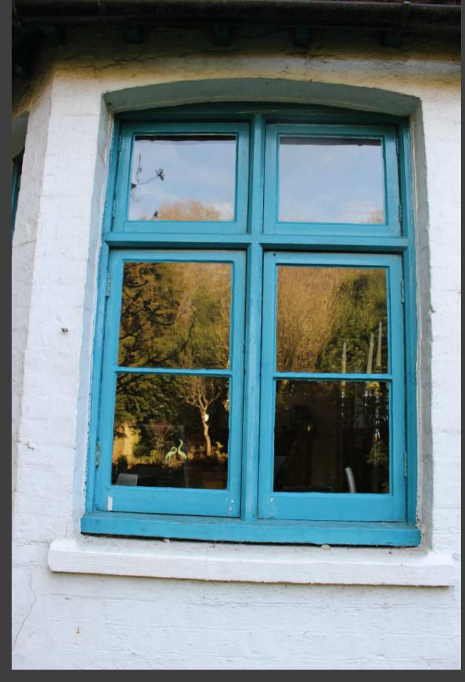
View of typical timber casement window, considered to be original.