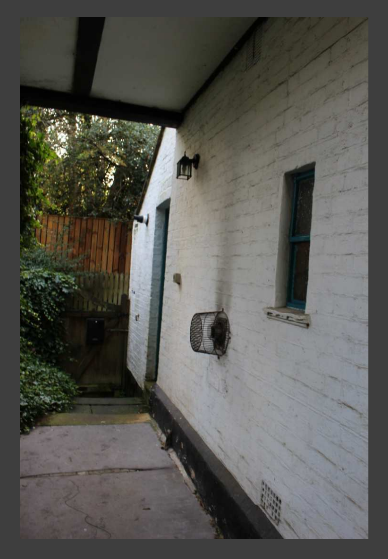
View of ground floor steel window to side WG.07