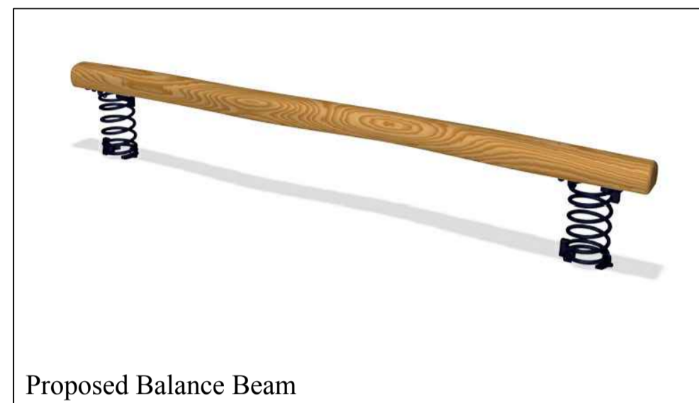
Proposed Balance Beam