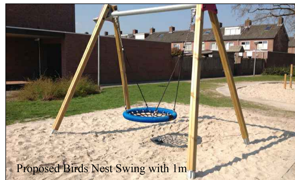
Proposed Birds Nest Swing with 1m