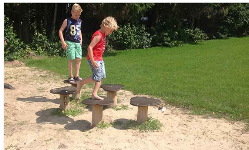
Proposed Waterlilies stepping stone, balancing play feature to be set within pebble feature