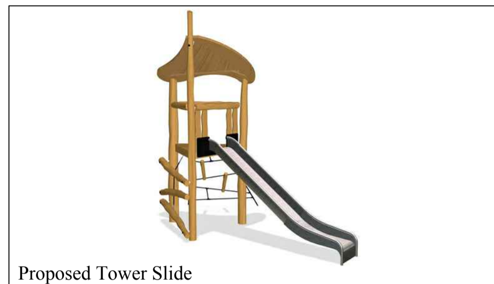
Proposed Tower Slide