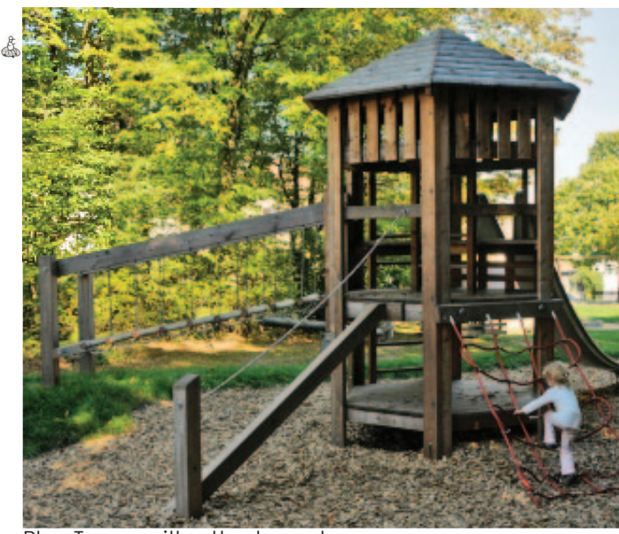
Play Tower with attachments