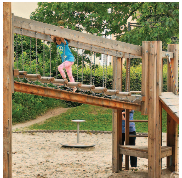
Running Board Timbers with safety board