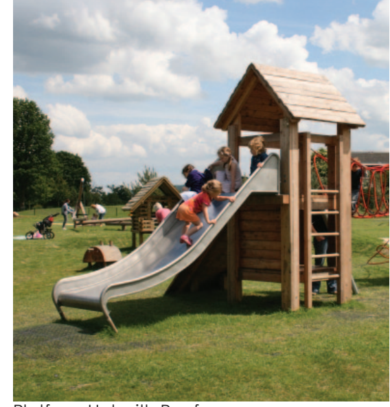
Platform Hut with Roof