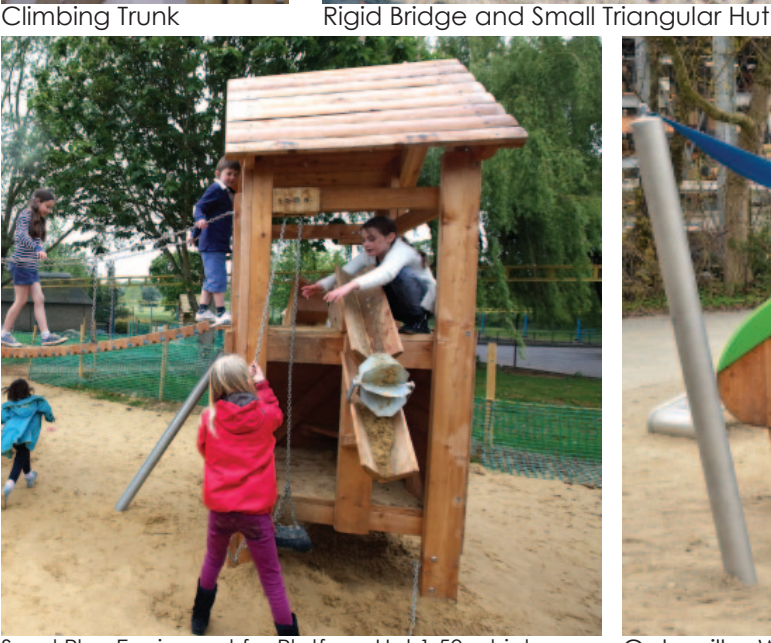
Sand Play Equipment for Platform Hut 1.50m high