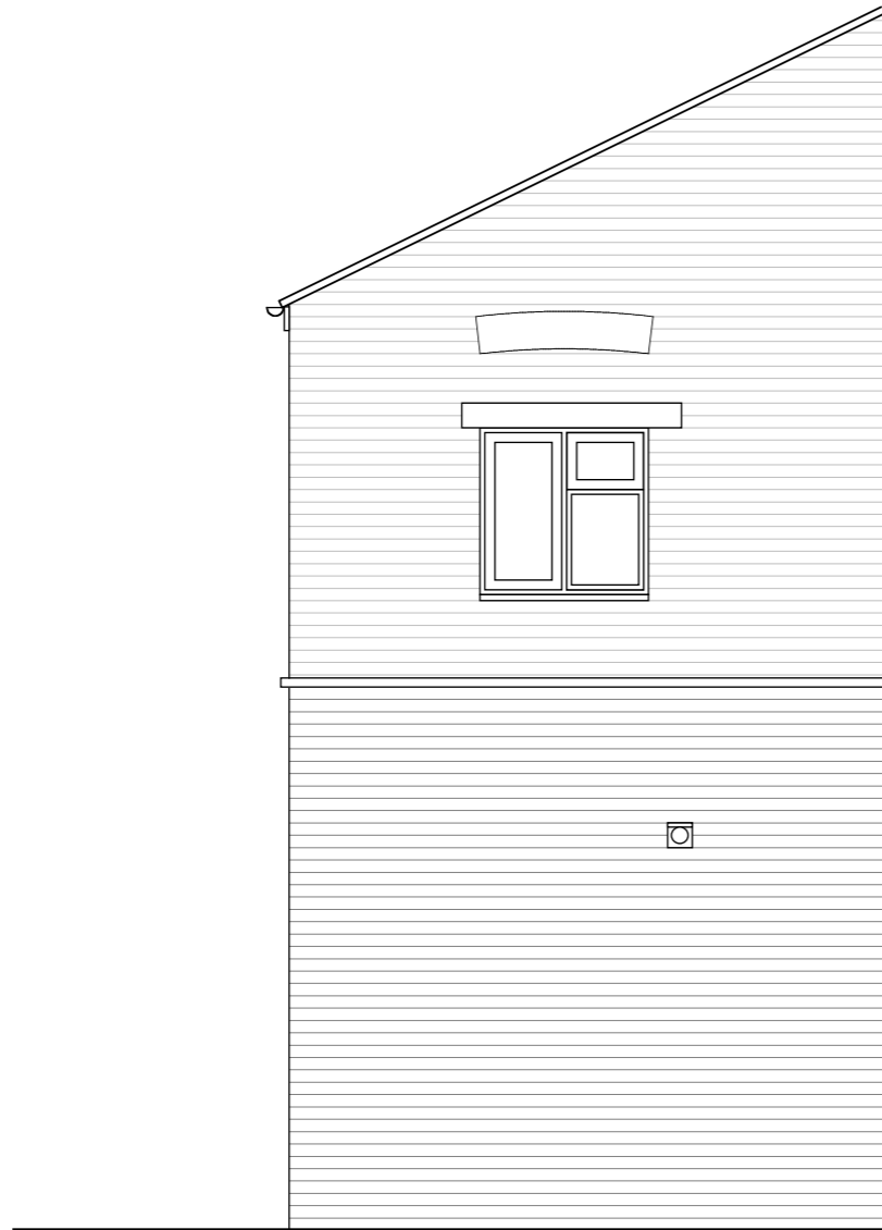
REAR ELEVATION Scale 1:50