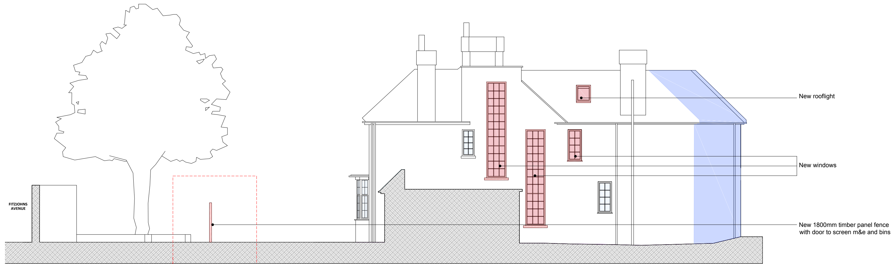
PROPOSED SIDE ELEVATION - C