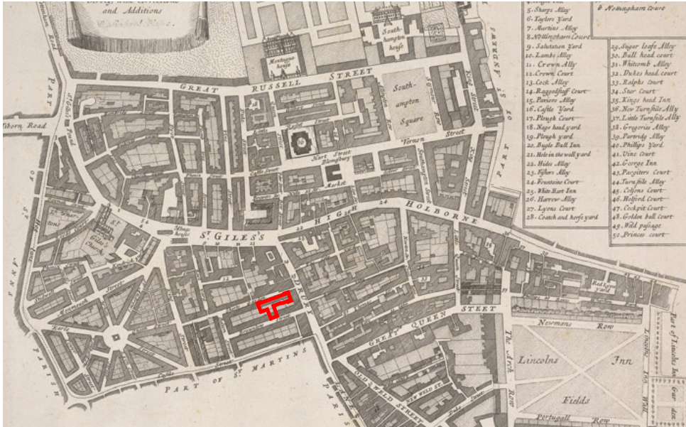
Figure 1: A map of the parish of St Giles's in the Fields, 1720, by Richard Blome (British Library)