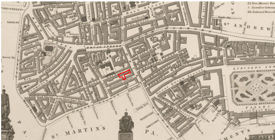
Figure 3: To the most noble John, Duke of Bedford. This plan of the united parishes of St. Giles in the Fields & St. George, Bloomsbury, 1824, by James Wyld (British Library)