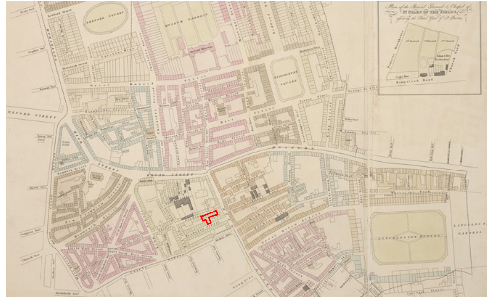
Figure 2: Plan of the parishes or division of St. Giles in the Fields and St. George, Bloomsbury, 1815 by Nathaniel Rogers Hewitt (British Library)