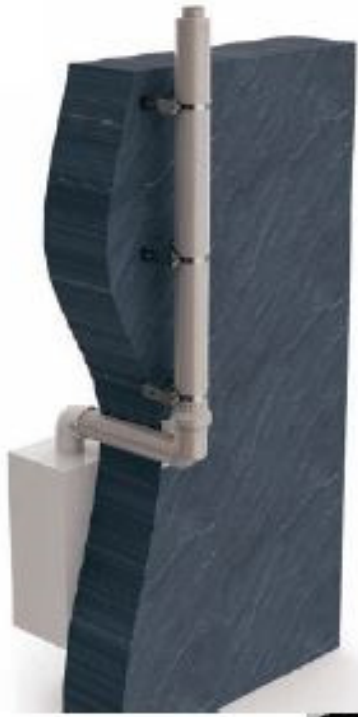
Flue detail (but in black) 1 metre projection through flat roof