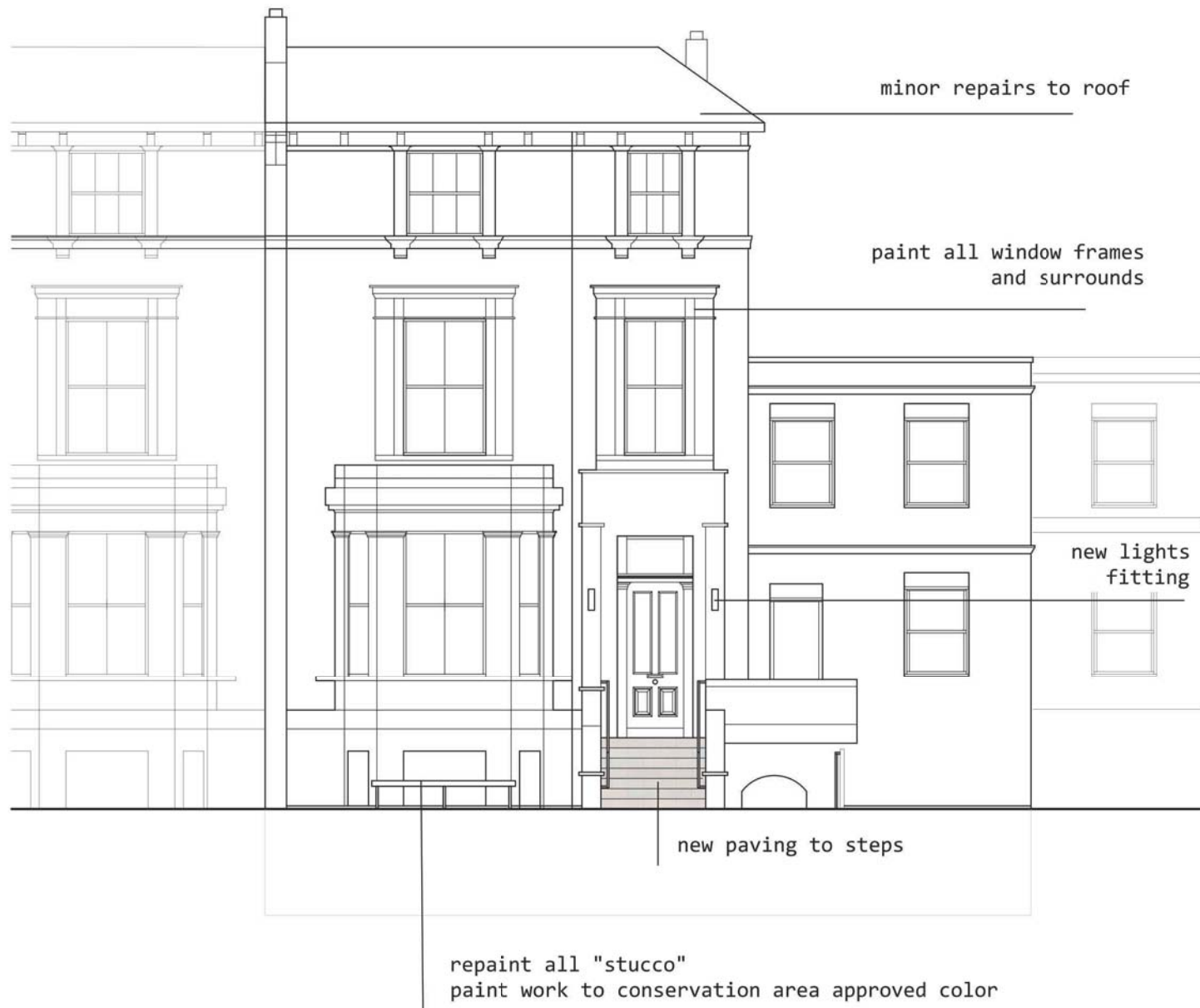
FRONT ELEVATION 1 to 100