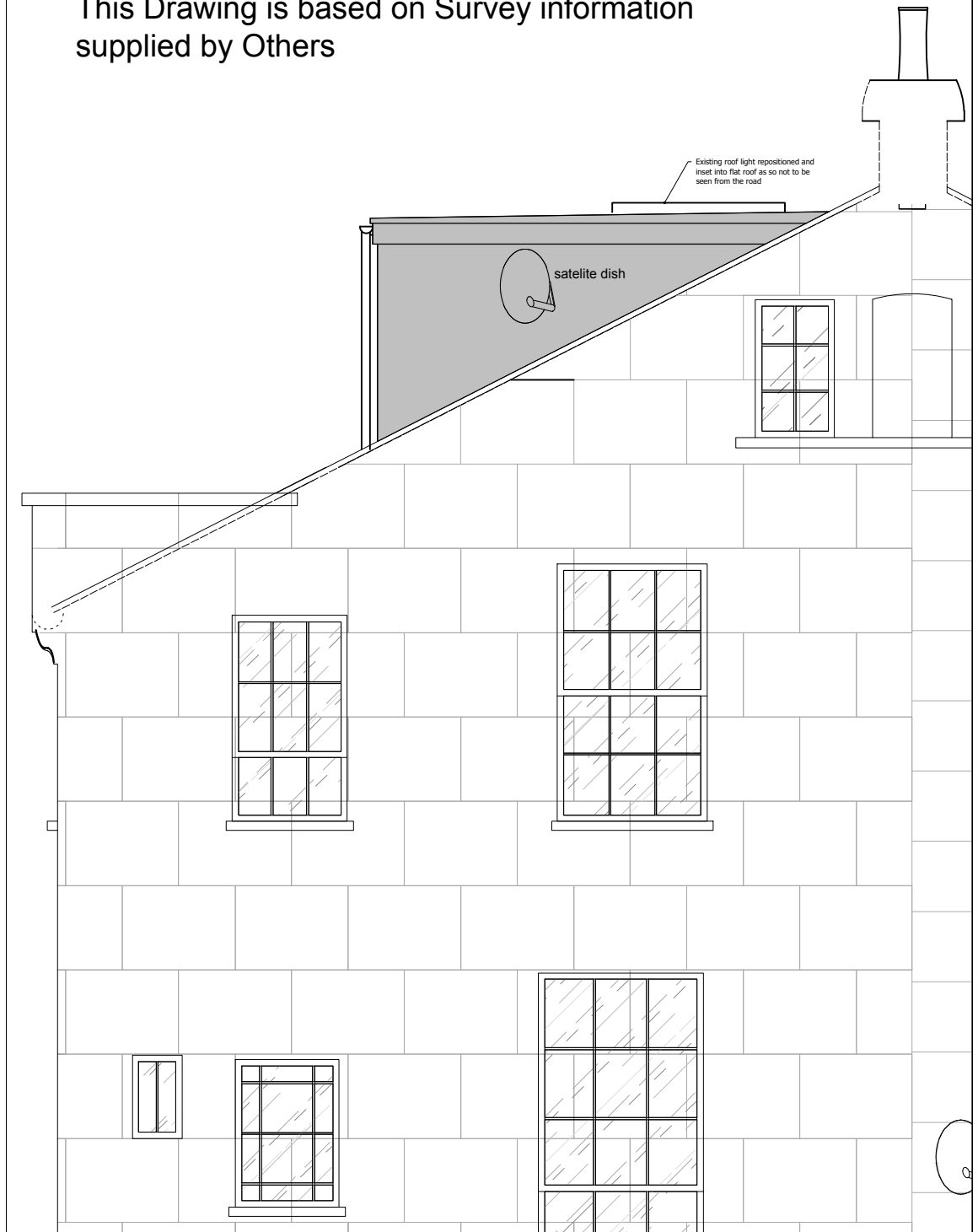
REAR ELEVATION AS PROPOSED 1:50 @ A3

This Drawing is based on Survey information supplied by Others