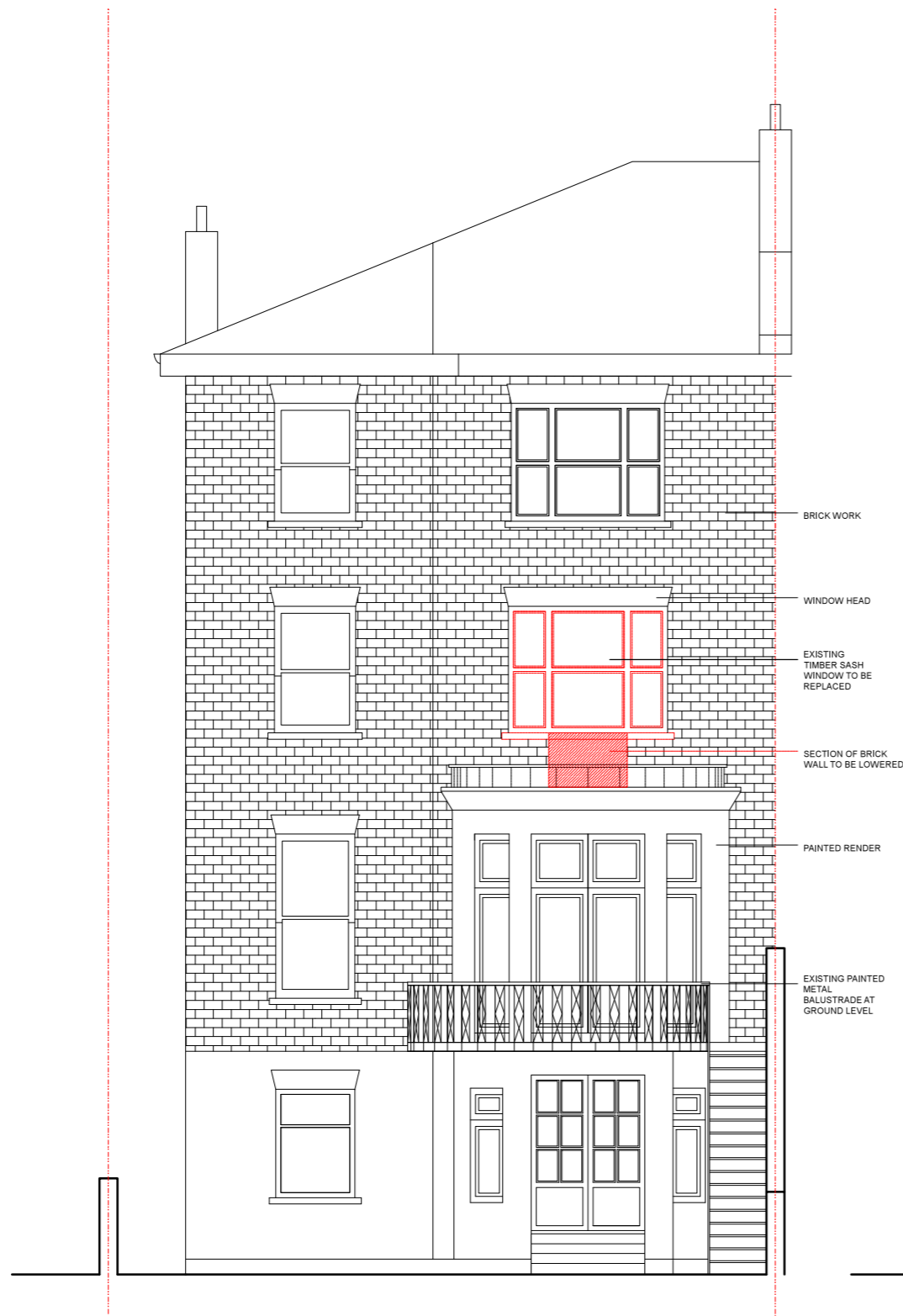
1 REAR ELEVATION EXISTING & DEMOLITION SCALE 1:100