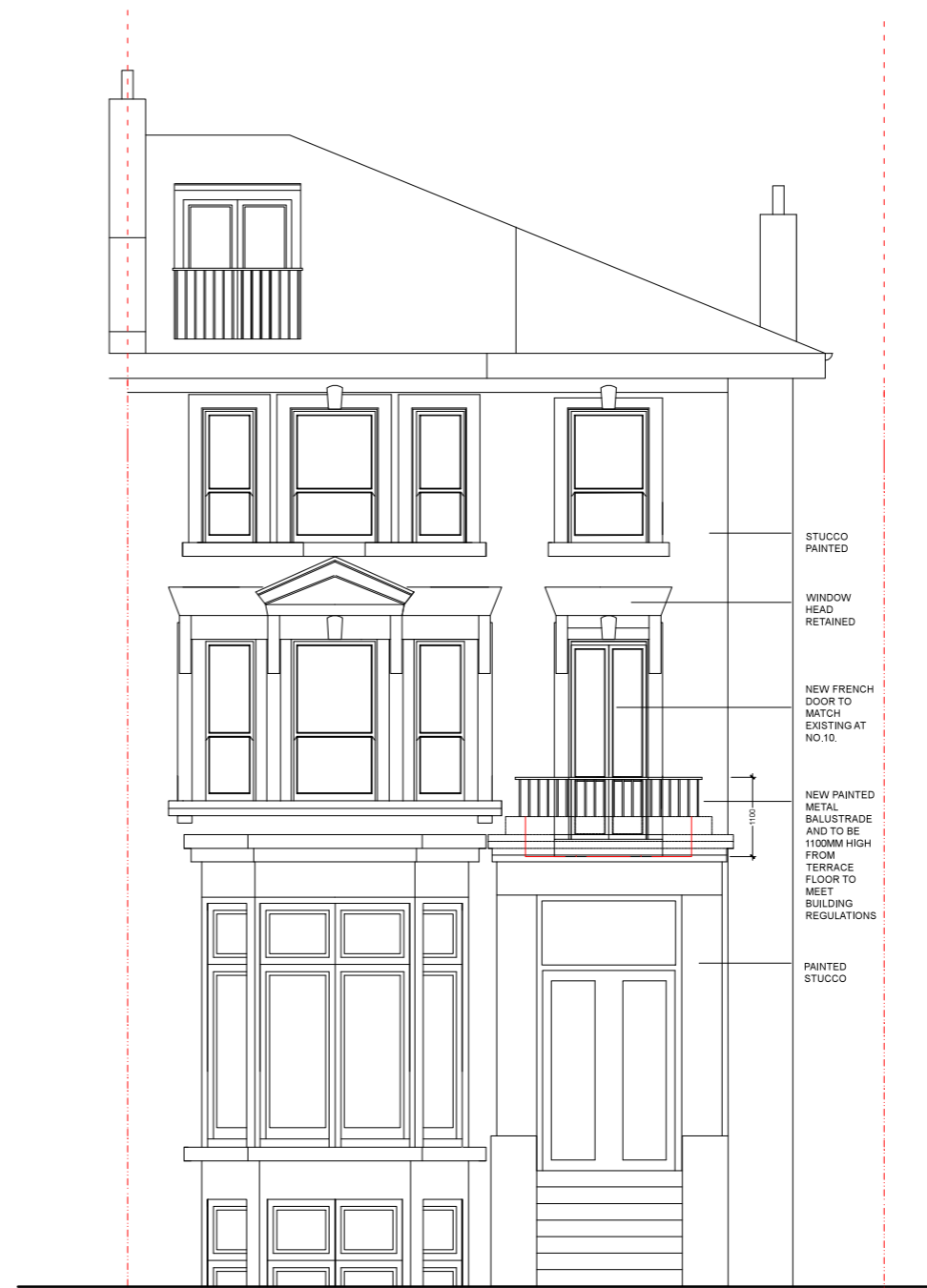
2 FRONT ELEVATION PROPOSED SCALE 1:100