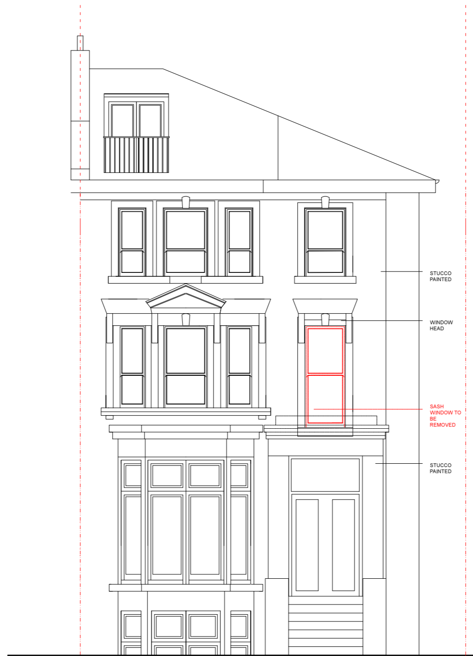
1 FRONT ELEVATION EXISTING & DEMOLITION SCALE 1:100