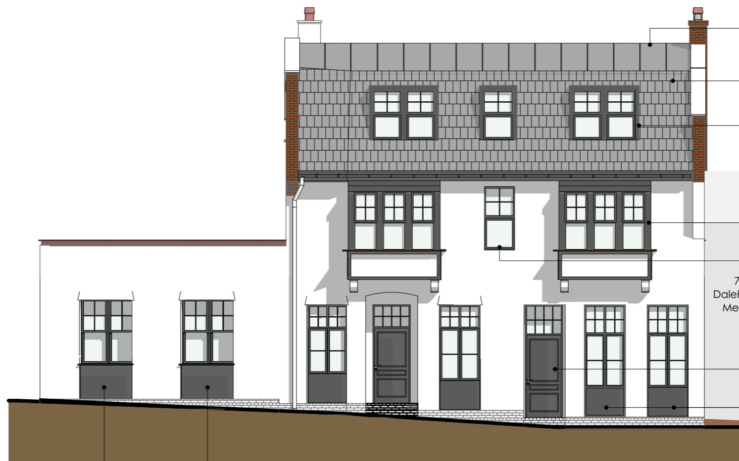
E2 1:100 Proposed West Elevation